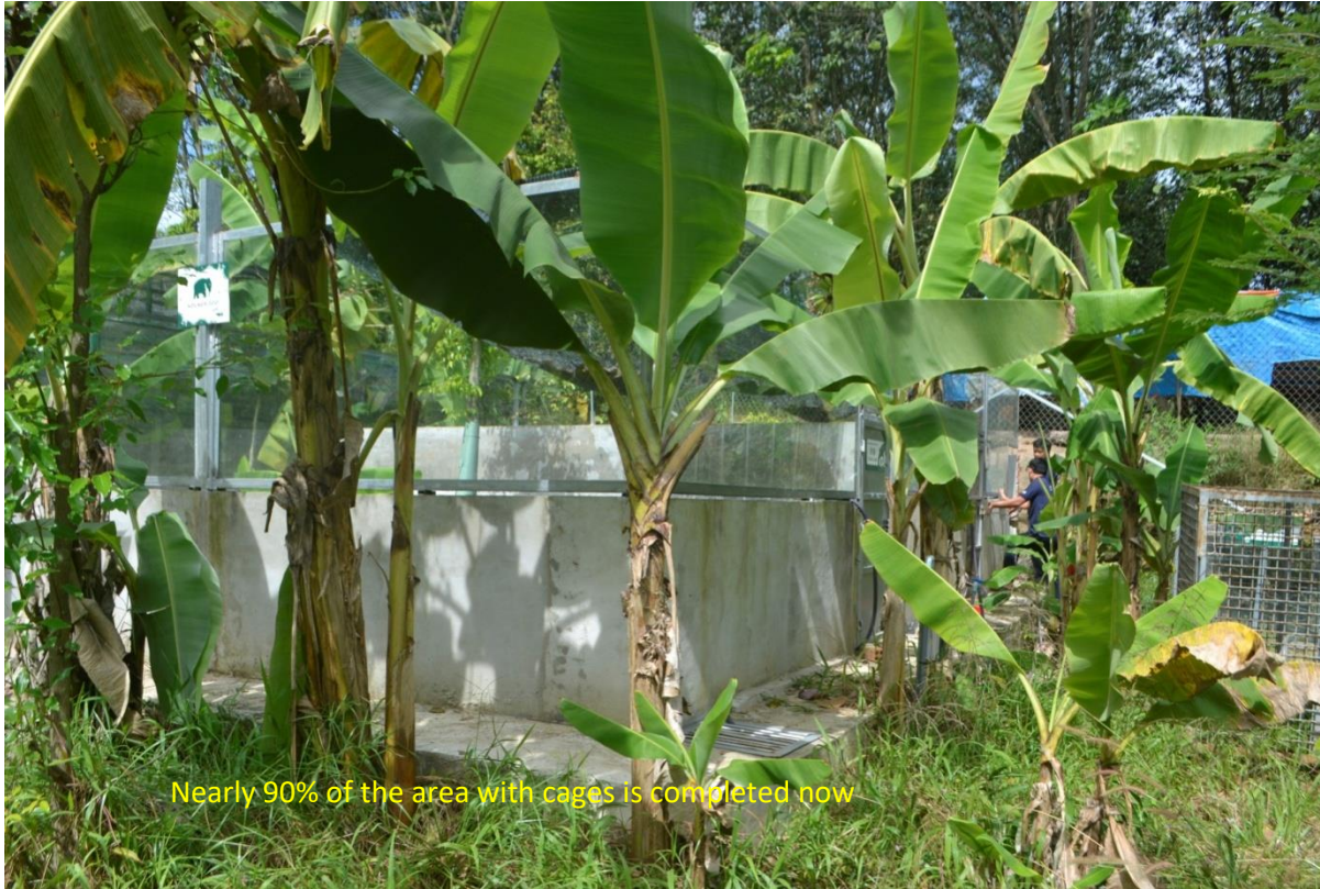
Nearly 90% of the area with cages is completed now