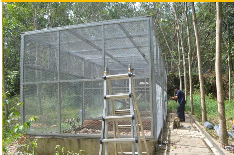
A small cage with a capacity of 9 m3 each is completed