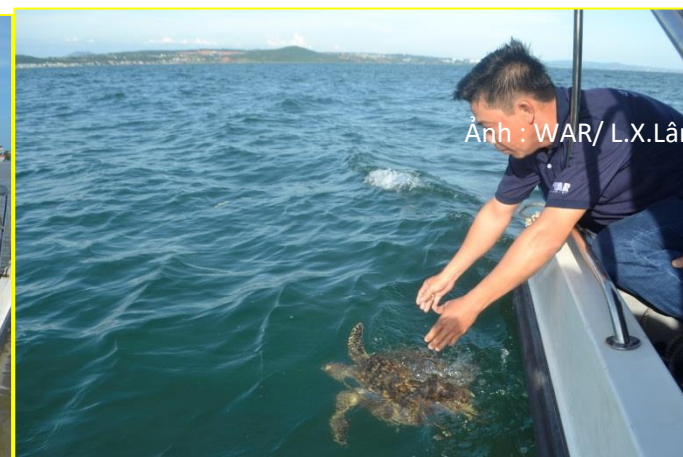
Photo 5: It was a joyful moment seeing turtles being released back into their natural habitat