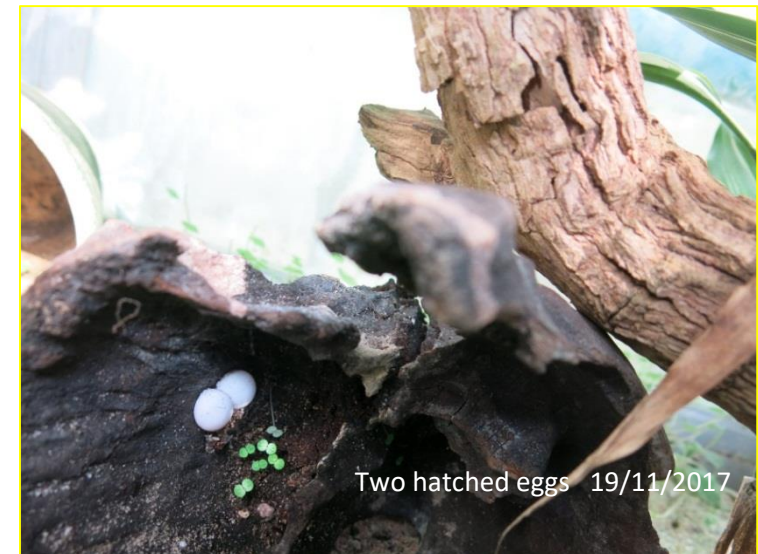
Two hatched eggs 19/11/2017

Raising precious rare wildlife species for gene conservation purposes is the long-term strategy of WAR organization. One of the examples is Psychedelic Rock Gecko ( Cnemaspis psychedelica ), which is endemic to Vietnam and can only be found only on Hon Khoai Island - Ca Mau province. This species has been added to the list of endangered species Appendix I CITES (Convention on International Trade in Endangered Species of Wild Fauna and Flora). The creation of many F1 generation individuals has marked the initiating success of the program. This is one of the joint programs between WAR and the Institute for Ecological and Biological Resources (IEBR).