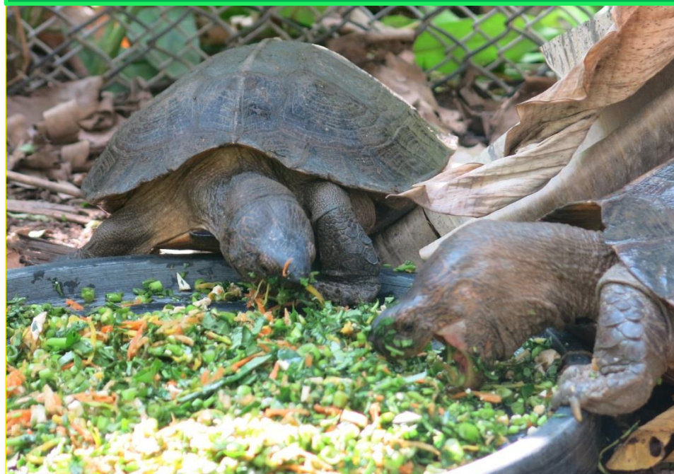
↑ Tortoises used in our breeding program during feeding