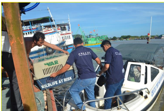
Photo 4: All transport boxes with turtles were moved onto the boat

WAR performed all health checks and tagged them before releasing. These turtles were rare wildlife species confiscated from restaurants in Ho Chi Minh City by The Marine Resource Protection and Quality Management Department and handed over to WAR Centre.