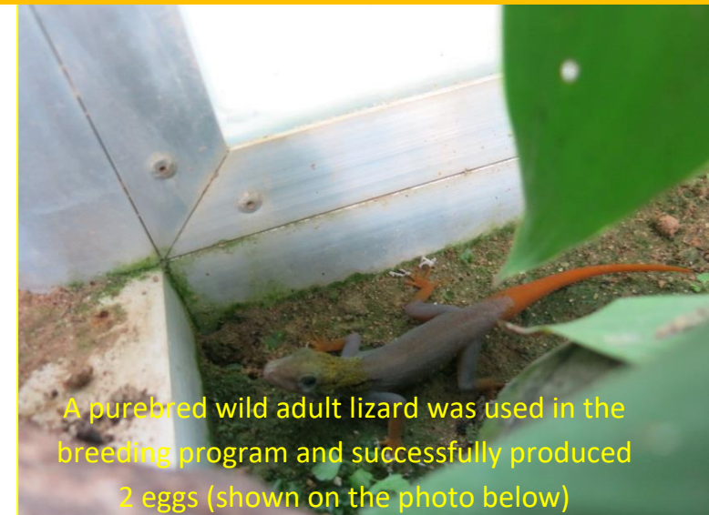
A purebred wild adult lizard was used in the breeding program and successfully produced 2 eggs (shown on the photo below)