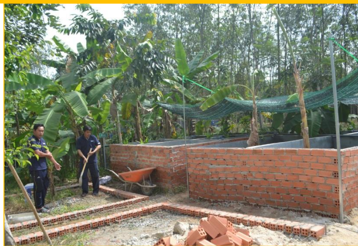
We are currently working on two more turtle enclosures

With the love for job and over 10-year extensive experience gained from working in former Rescue Center, besides taking good care of the wildlife species, our WAR team has also built breeding facilities for them. This shows their deep love for nature and wildlife, responsibility for the natural environment and society. We are hoping that our engagement and enthusiasm will be passed down to the next generation with a view to preserving natural diversity.