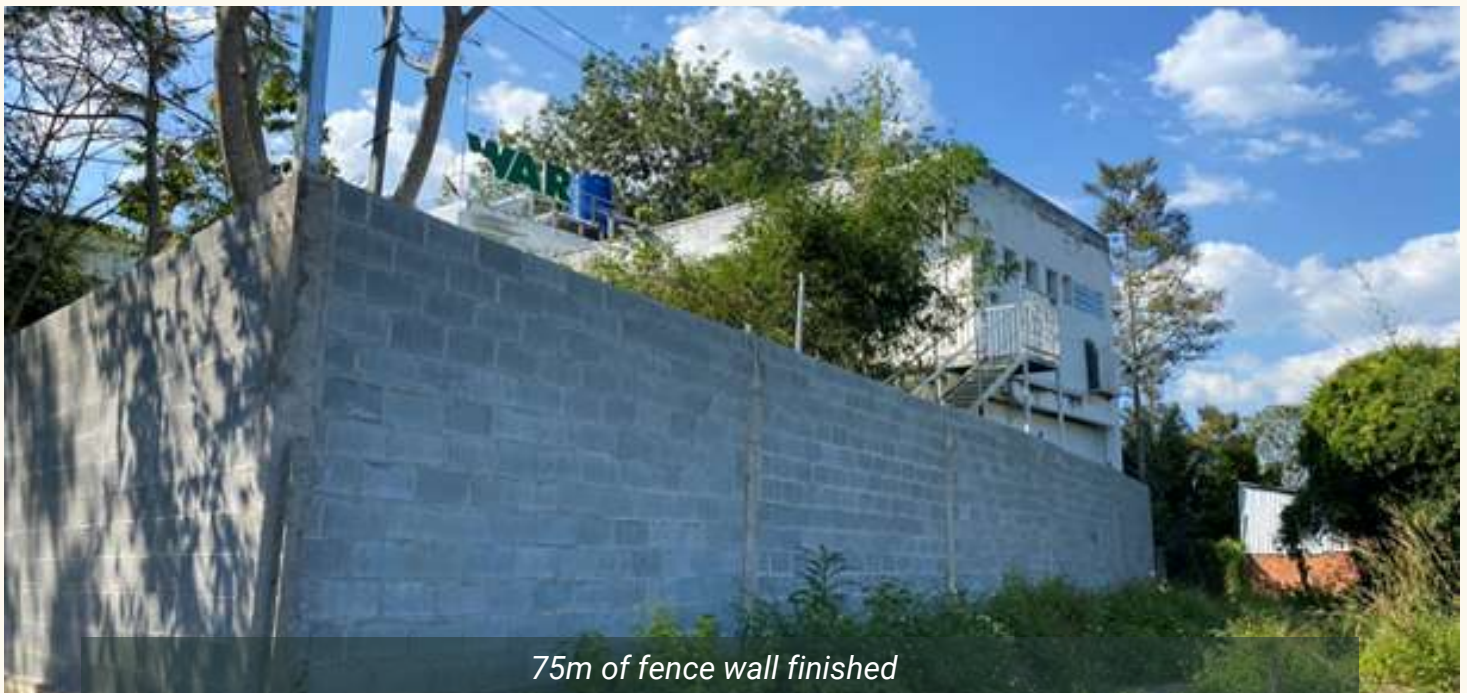
75m of fence wall finished