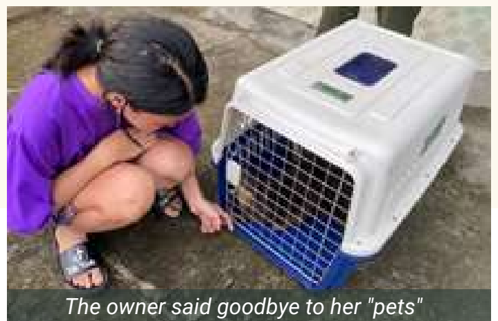
The owner said goodbye to her "pets"

Currently, two otter babies are being cared for at Dau Tieng Wildlife Conservation Station. During this time, the veterinarian and animal care staff have been providing rehabilitation session for the two babies to restore their wild instincts