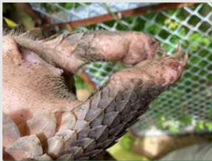
The two wounds at the behind legs

This pangolin is in good health condition at Dau Tieng Conservation Station. In the near future, we will conduct pairing as well as monitor the breeding process of this pangolin.