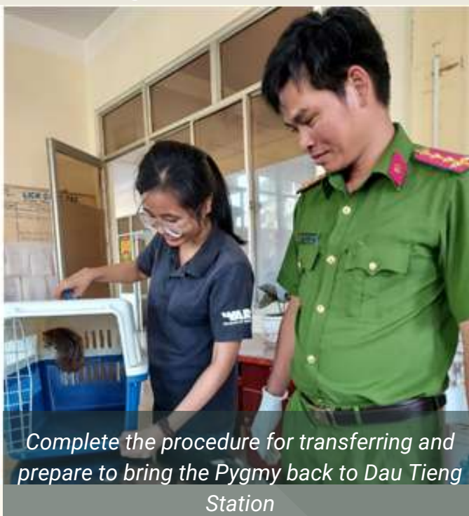
Complete the procedure for transferring and prepare to bring the Pygmy back to Dau Tieng Station

In addition, on December 22, 2022, WAR received and rescued another Pygmy Slow Loris weighing 0.5kg from the Police of Tan Phuong district, Tien Giang province under the witness of the Department of Agriculture and Rural Development of the Tien Giang Province. Currently, this Pygmy Slow Loris is being cared for at Dau Tieng Wildlife Conservation Station.