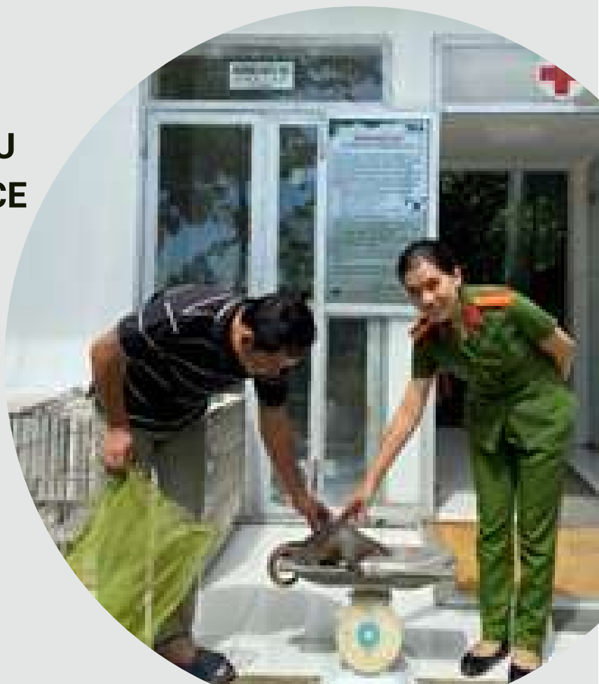
The civil security transferred the Sunda Pangolin to the conservation station

From our observation, we realized that the Vietnamese people's awareness of and willingness for wildlife protection improved significantly recently. On September 27th, 2022, the WAR's hotline received a call from the local people stating their willingness to transfer a Sunda Pangolin ( Manis Javanica ) to the Dau Tieng Wildlife Conservation Station. Without hesitation, we coordinated with the Binh Duong Provincial FPD to travel the field immediately.