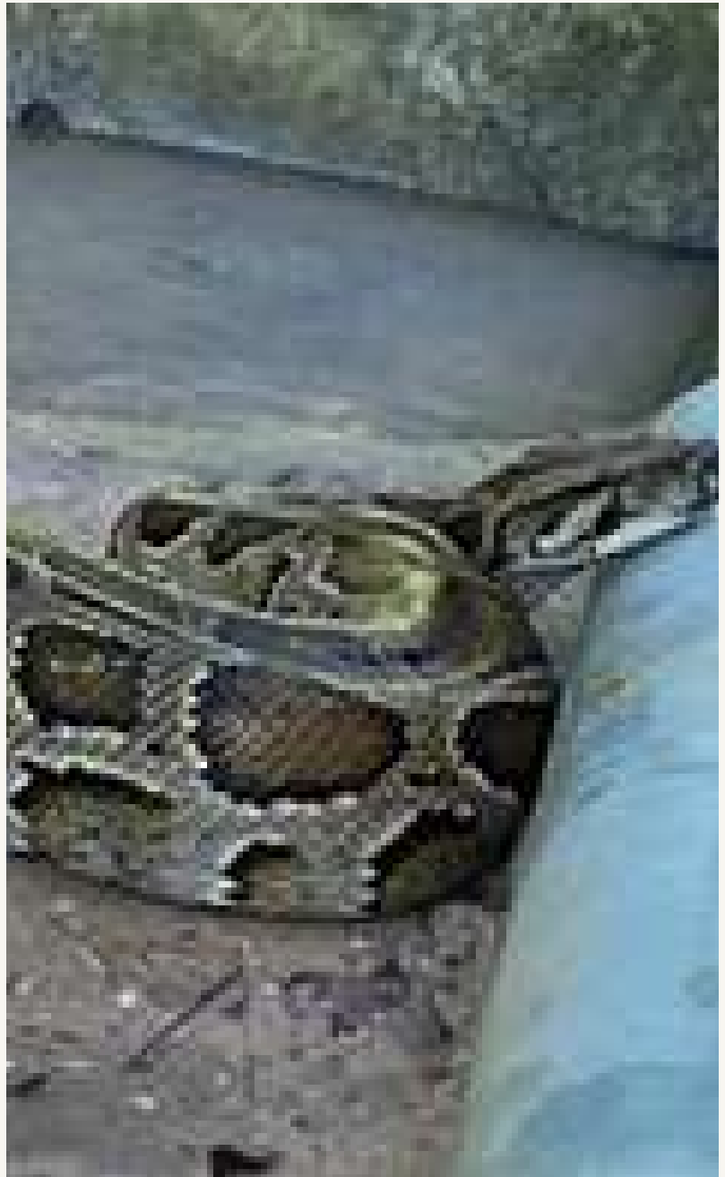
The 2 pythons are nervous as they have been kept in captivity for a long time

According to the authorities, all three pythons are illegally kept in private houses, so the authorities have mobilized those owners to voluntarily hand them over to the Rescue Station before releasing them into the wild. We have cooperated with Binh Duong Provincial FPD to release 1 out of 4 individuals into the forest. Currently, there are 3 individuals being raised at Dau Tieng Wildlife Conservation Station.