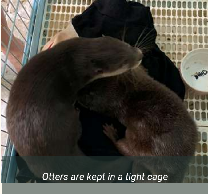
Otters are kept in a tight cage

After receiving information about a pair of Asian Small-clawed Otter ( Aonyx cinereus ) who are in need of urgent support, the WAR rescue team rushed to the field.