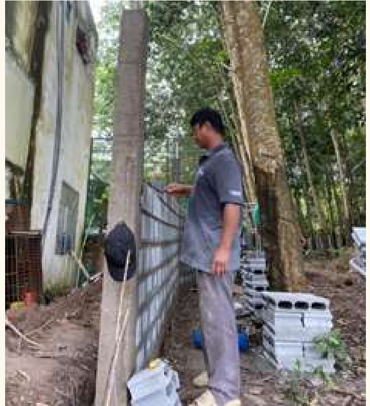
Staff are hard-working under construction