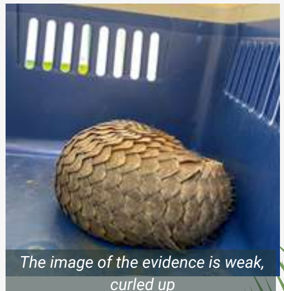
The image of the evidence is weak, curled up

The pangolin is currently receiving dedicated care and attention from the staff and veterinarian at the Dau Tieng Station.