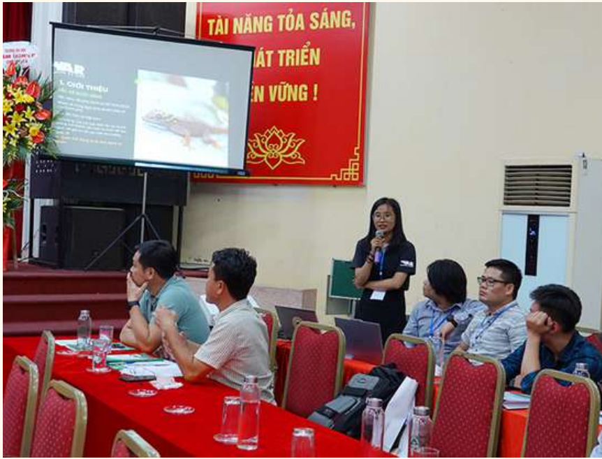
Wildlife At Risk representative at the national conference

On September 11th, 2022, the 5th National Conference on Amphibian and Reptile in Vietnam took place at the Vietnam National University of Forestry, Hanoi city. Research results on amphibians and reptiles in Vietnam in recent times on ecology, ecology exploitation, breeding and protection of amphibians and reptiles in Vietnam were presented. Possible directions for development of research areas on amphibians and