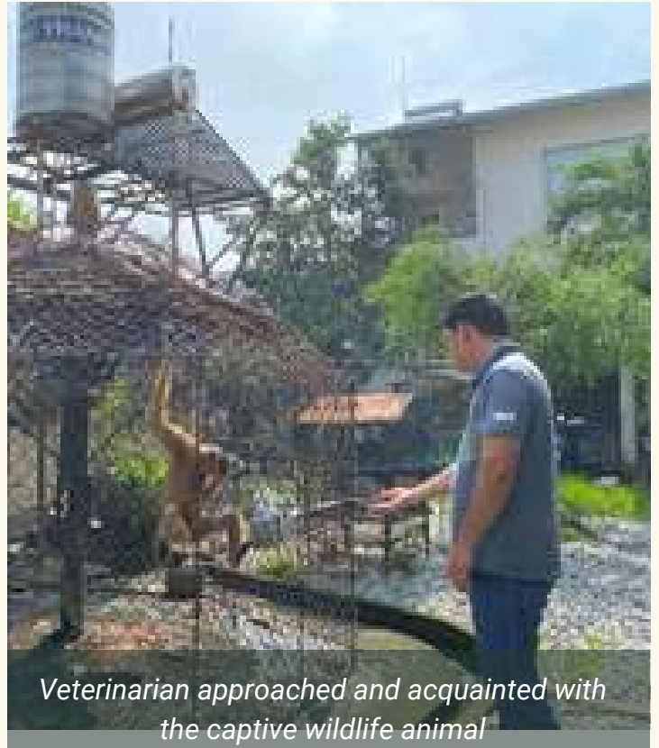
Veterinarian approached and acquainted with the captive wildlife animal

In the morning of July 27th, 2022, a rescue team of Wildlife At Risk was quickly mobilized to the field to receive two gibbons after getting the An urgent information requiring assistance from the authorities. The two gibbons were fed by a 87-year-old man at his home, in a very cramped cage, located in an alley on Pham Ngu Lao street, Hiep Thanh ward, Thu Dau Mot city, Binh Duong province. At first, the rescue team was quick to assume that it would be very easy to capture the two gibbons in captivity, however, it took us a lot of time to approach the two animals to get them familiarized with the team members. Because they appeared very shy and fearful of strangers as a result of their years in captivity.