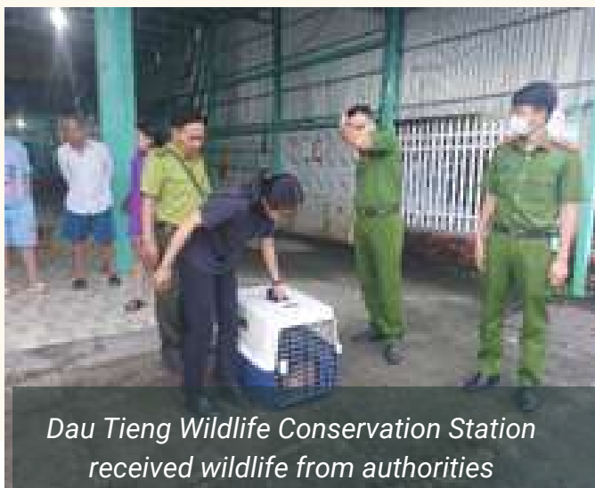
Dau Tieng Wildlife Conservation Station received wildlife from authorities

After over 6 hours of departing from Dau Tieng, Binh Duong province, we were at the field. When we arrived, the authorities were at the scene and had prepared all the relevant documents and procedures. In the backyard of the house, we witnessed the two baby Otters being kept in a clean room, including air conditioning to help balance the temperature.