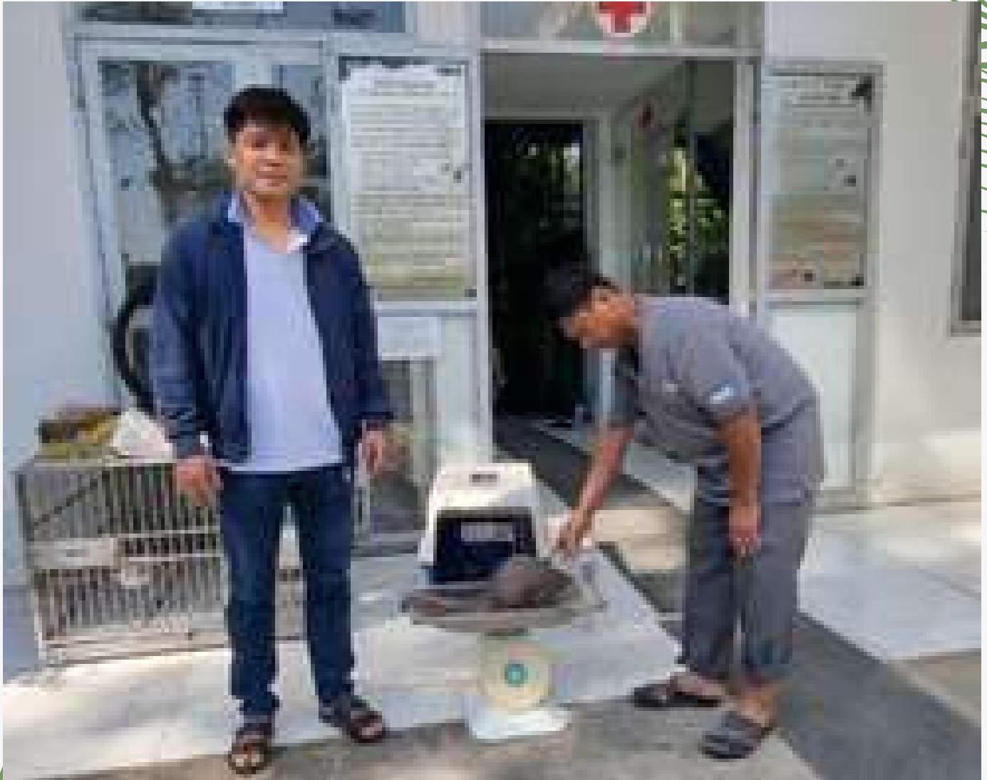
Hand over exhibit

In the last days of the year 2022, the illegal trade of various items has seen a significant increase. Illegal wildlife trade is no exception. On December 28, 2022, the Forest Protection Department (FPD) of Ben Cau district, Tay Ninh province received a trust from the local police to support the care of a 3kg baby Sunda pangolin as evidence of illegal trade in the area.