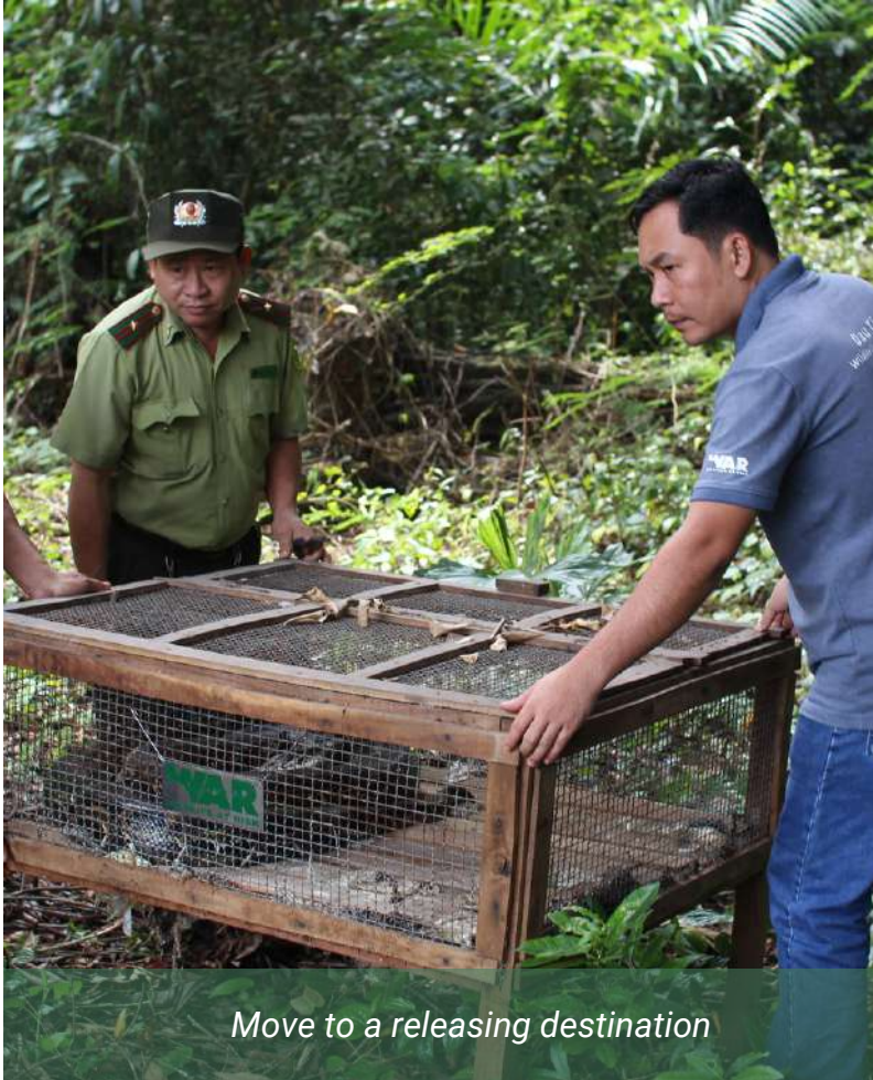
Move to a releasing destination