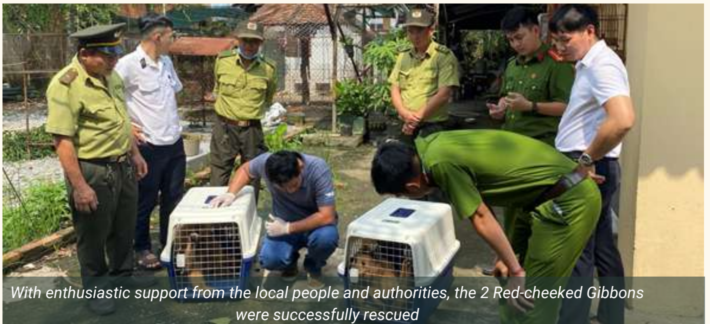
With enthusiastic support from the local people and authorities, the 2 Red-cheeked Gibbons were successfully rescued

We do welcome the spirit of self-discipline to enforce the law from the owner. At Dau Tieng Wildlife Conservation Station, they will be treated and looked after by the devotion of both vet and WAR's staff.