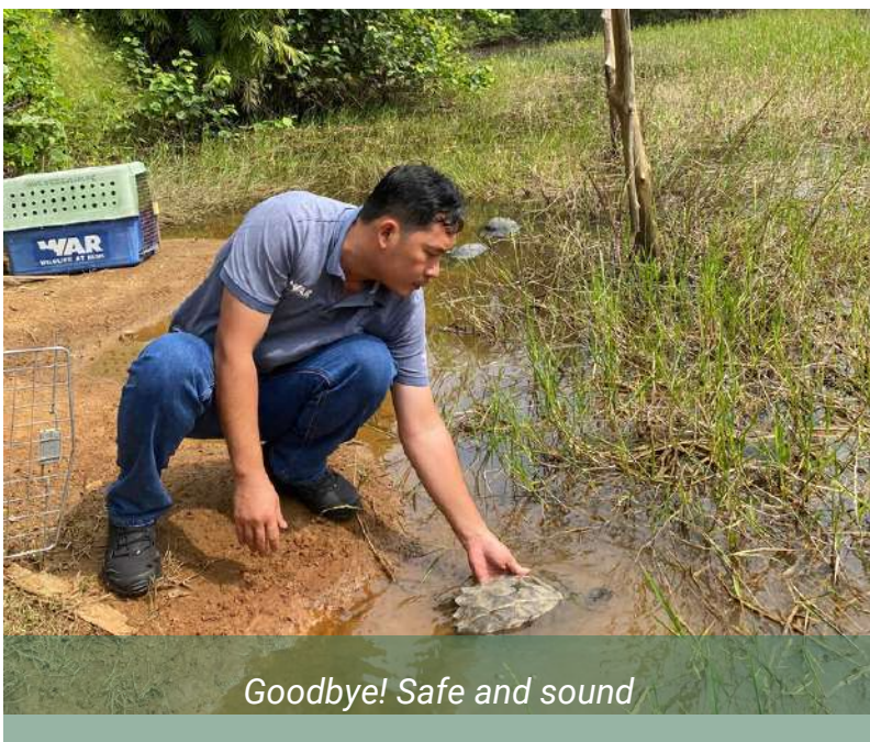
Goodbye! Safe and sound

On November 1st, 2022, WAR collaborated with Binh Duong Forest Protection Department to successfully released 27 wild species including 5 Southern Pig-tailed Macaques ( Macaca ironina ), 2 Common Long-tailed Macaques ( Macaca fascicularis ), 2 Stump-tailed Macaques ( Macaca arctoides ), 2 Indian Rock Pythons ( Python molurus ), 3 Giant Asian Pond Turtles ( Heosemys grandis ),