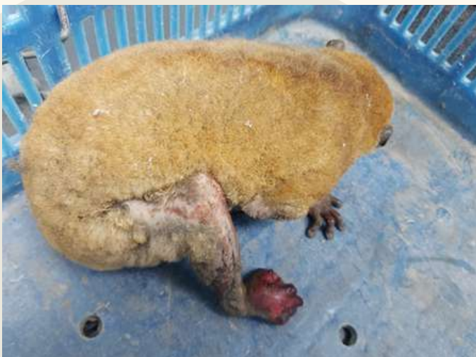
A close view at the wound in her behind leg due to electric shock

On August 12th, 2022, local people in Binh Duong province handed over a loris in Di An city to the rangers at Binh Duong FPD. After receiving information mentioning about the loris which is in urgent need of treatment, care and support from the authorities, we quickly mobilize to the field.