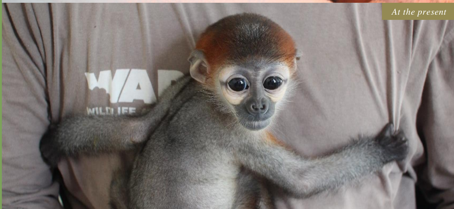
At the present