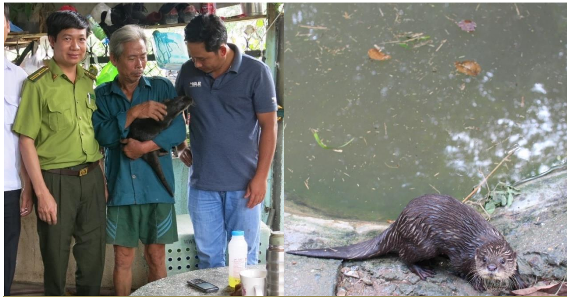
An image of Asian small-clawed otter is handed over to WAR