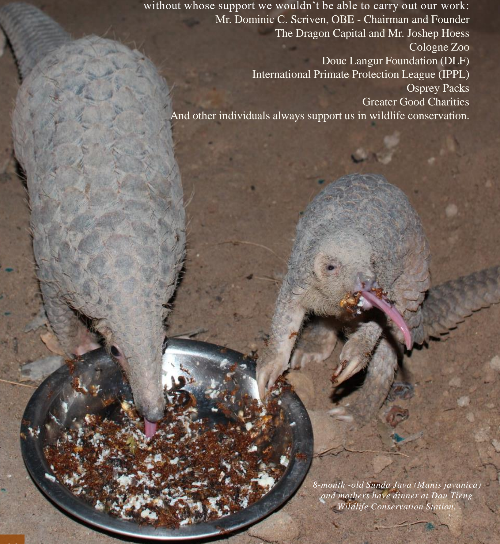
8-month -old Sunda Java (Manis javanica) and mothers have dinner at Dau Tieng Wildlife Conservation Station.

And other individuals always support us in wildlife conservation.