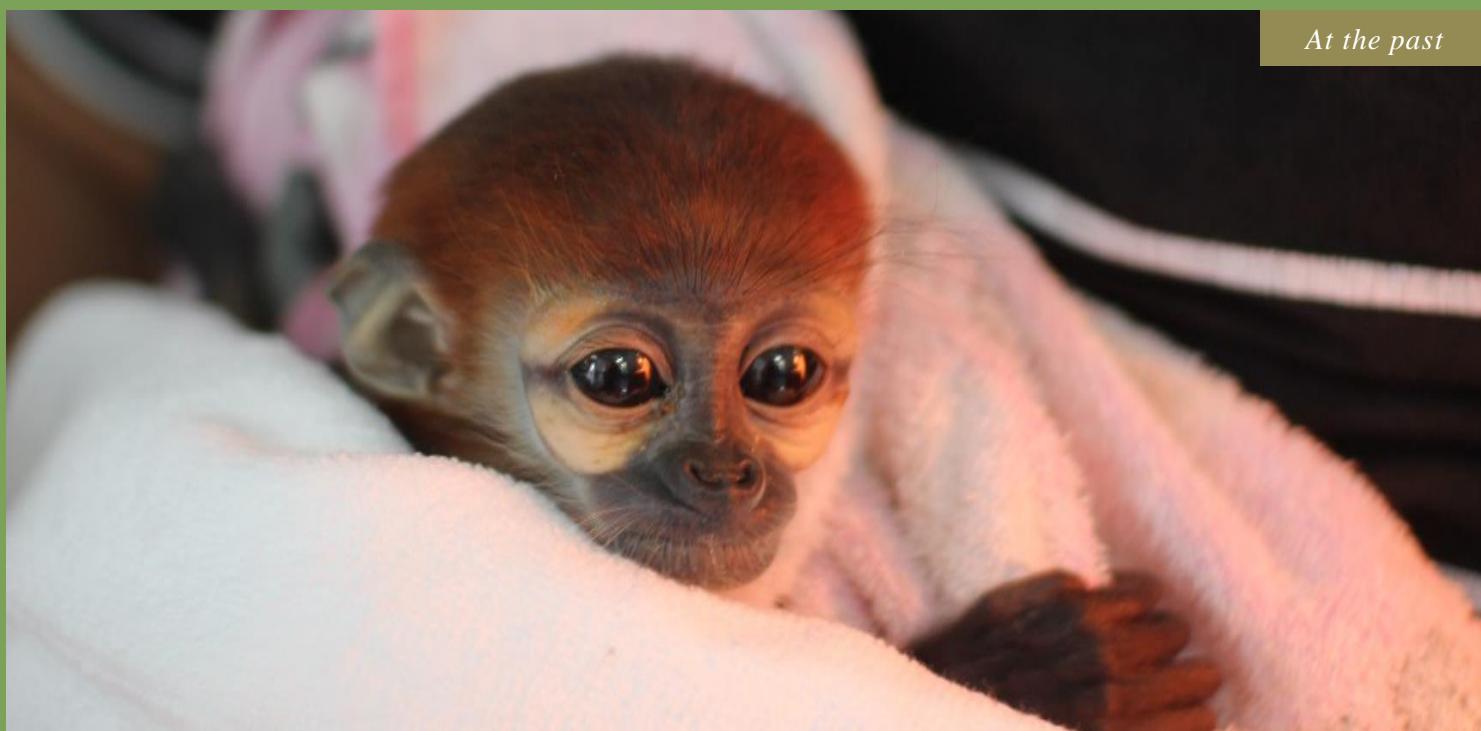
At the past

We immersed in the feeling of compassion when we saw him – an undernourished Douc langur. We worried about the status of his health during the long trip from Quang Ngai Province to Binh Duong Province because he was so weak. Unfortunately, he was safe once coming to Dau Tieng Station. WAR's vet and animal keepers made an effort to treat and look after him. He is in a good health at our station at the moment.