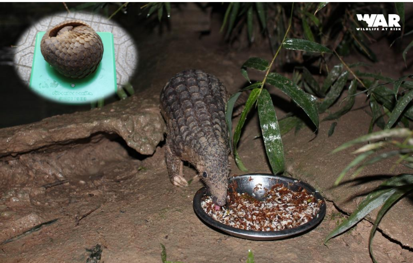
A Sunda pangolin is stronger in Dau Tieng Station and ant-egg is one of the favorite food for her

It is undeniable that rescuing pangolin is difficult. However, it is not as difficult as looking after them in good health due to the scarcity of food in the period of COVID-19. We have to buy from a large number of different places where the food is good.