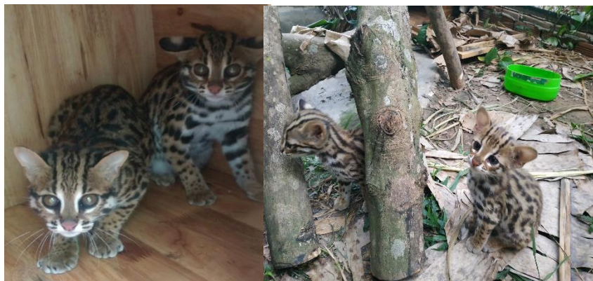
At 2 months of age, two Leopard cats have been taking care of and fed at Dau Tieng Wildlife Conservation Station

Welcome 7 Leopard cats ( Prionailurus bengalensi ) to Dau Tieng Wildlife Conservation Station