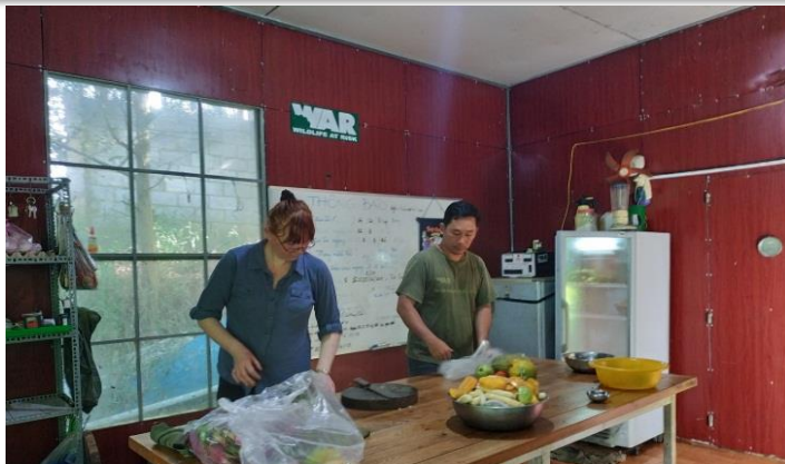
The international volunteer is preparing food for animals