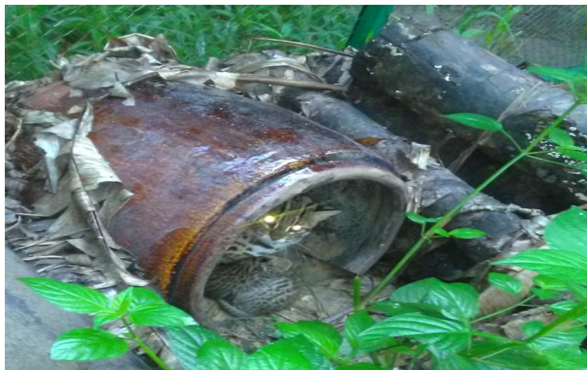
Pair of newborn kitten

The more bred wildlife and release the better for conservation biodiversity and more opportunities to future