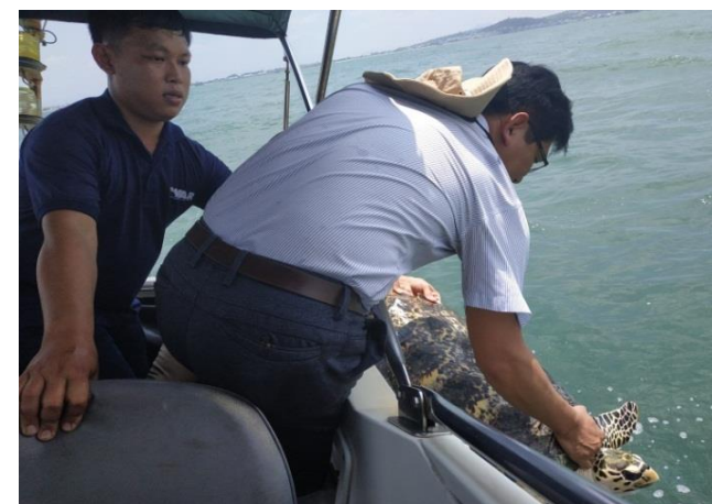
She comes back to the sea

In early July, 2019, a Hawksbill sea turtle ( Eretmochelys imbricata ) which is listed in Decree 160/2013/ND-CP dated 12/11/2013 of the Government, with weight of 31 kg was released successfully at Phan Thiet Bay. Before returning the sea, this species was marked with tag by WAR's veterinarian. Besides, it is known that the Sea turtle kept in captivity for a long time at a restaurant in Ho Chi Minh City. Without significant supports from The Marine Department of Binh Thuan and Ho Chi Minh, we could not carry out this action. We would like to thank to all of contributors for protecting wildlife.