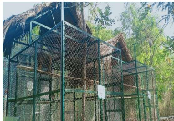
The second monkey cage was constructed with the size of 3 x 4 x 3 (m)