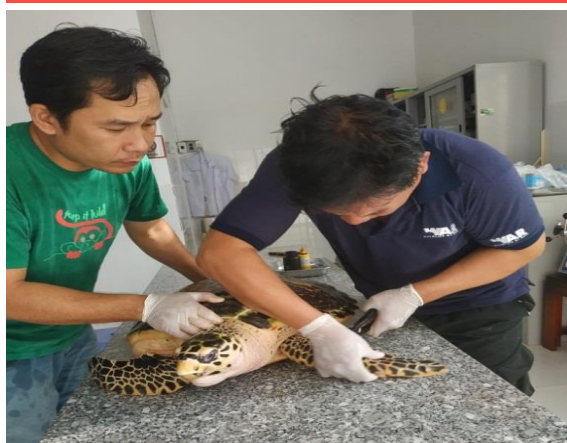
The Sea turtle being tagged before release