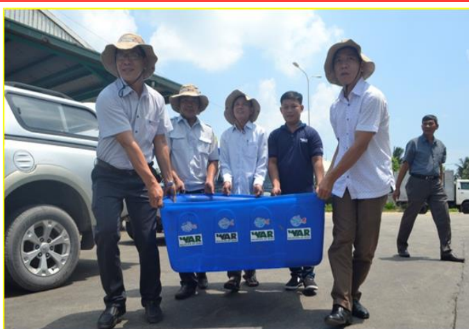
It is moved down a harbor