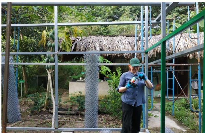
She is painting primate's cage