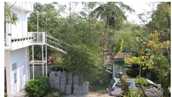
The fire escape stair fire fight and prevention is in office building