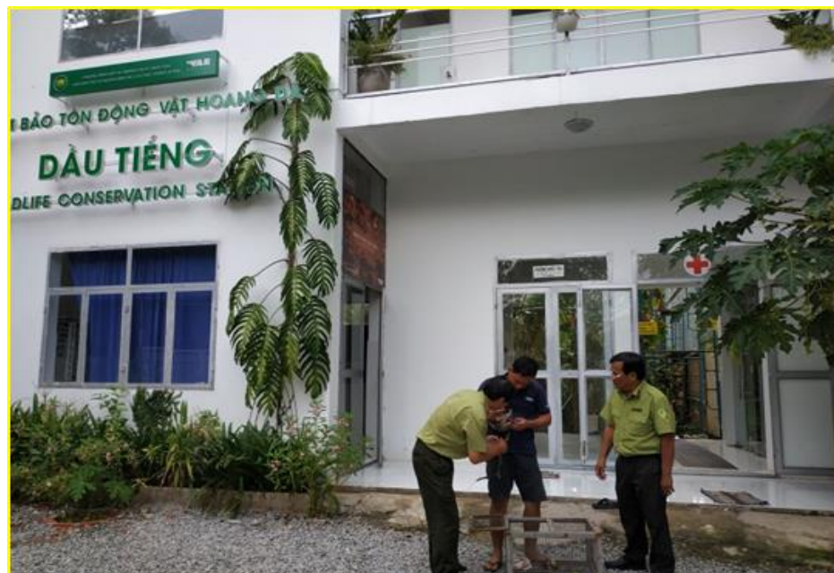
Receiving 2 monkeys from Binh Duong Province Forest Protection Department

In August, 2019, WAR received 1 Pig-tailed macaques ( Macaca leonina ) and 3 Long-tailed macaques ( Macaca fascicularis ) from Binh Duong and Ben Tre Province Forest Protection Department. Due to long captivity in local house, all of them were either exhausted or in bad conditions. Therefore, after saving, they have been caring by WAR's staffs to return the forest when they are in good shape.