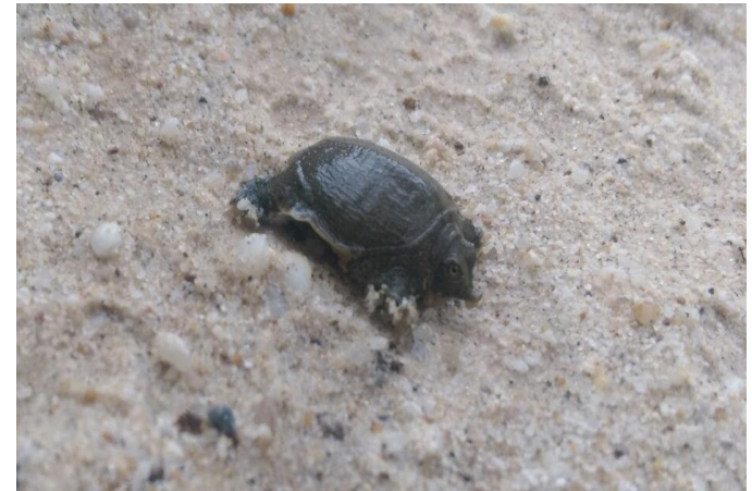
The Softshell turtle ( Amyda cartilaginea ) is few days old