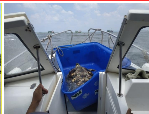
Going to the releasing destination

In early July, 2019, a Hawksbill sea turtle ( Eretmochelys imbricata ) which is listed in Decree 160/2013/ND-CP dated 12/11/2013 of the Government, with weight of 31 kg was released successfully at Phan Thiet Bay. Before returning the sea, this species was marked with tag by WAR's veterinarian. Besides, it is known that the Sea turtle kept in captivity for a long time at a restaurant in Ho Chi Minh City. Without significant supports from The Marine Department of Binh Thuan and Ho Chi Minh, we could not carry out this action. We would like to thank to all of contributors for protecting wildlife.