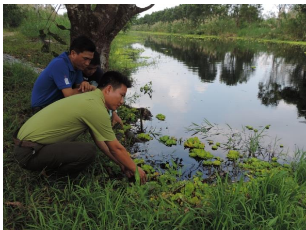
WAR's staff collaborates with foresters are to set turtles free