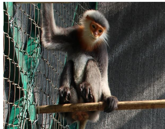
The femal Grey-shanked douc langur has been housing at Dau Tieng Station during long time in intensive care