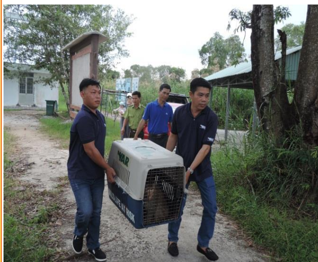
WAR's staffs are preparing to release monkey

On 14th November 2019 – 3 Long tailed macaques ( Macaca fascicularis ), 1 Bengal monitor ( Varanus nebulosus ) and 5 Malayan box turtle ( Cuora amboinensis ) with a total weight of 12.7 kg were successfully released to U Minh Thuong National Park, Kien Giang Province by Wildlife At Risk (WAR) in cooperation with Binh Duong Province Forest Protection Department and Forest Protection Department of Dau Tieng District.