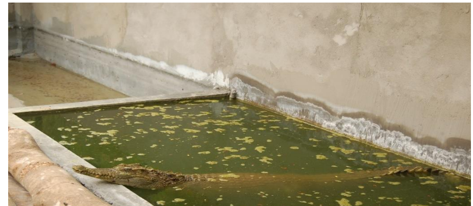
The crocodile is relaxing at pool after rescuing

It was only week from 07 to 14 October, 2019 that Wildlife At Risk received 6 wildlife by inhabitant's willingness around the South of Vietnam, including Bengal monitor ( Varanus nebulosus ), Enlongated tortoise ( Indotestudo elongata ), Yellow-headed temple turtle ( Heosemys annandalii ), Malayan snail-eating turtle ( Malayemys subtrijuga ), Corcodile ( Crocodylus siamensis ). WAR does appreciate the support of authorities and the voluntary of local people about wildlife.