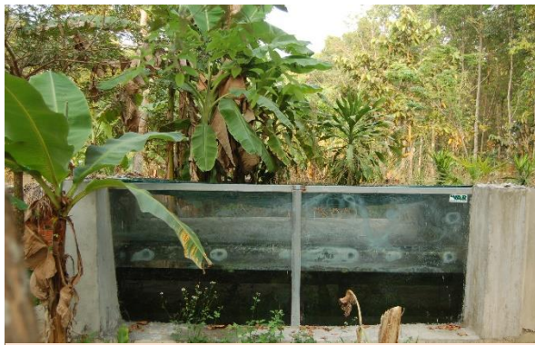
The turtle display was built at Dau Tieng Station