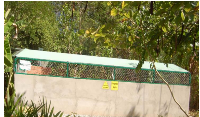
The crocodile cage is more than 50 m 2 in an area

Wishing to create the conditions for wildlife as good as possible at Dau Tieng Wildlife Conservation Station, construction and development of infrastructures were built daily. Within 6 months, a crocodile cage (more than 50 m 2 in an area), a turtle cage on display (an area of 8 m 2 ), a monkey cage (the size of 3 x 4 x 3 (m)) and a fire prevention and fighting systems were completed. During construction, WAR always focused on satisfaction for a variety of wildlife species. Animal enclosures was almost in commission such as playground, living space for the living needs of wildlife at here.