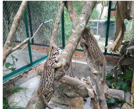
Two kittens have been having jolly time at Dau Tieng Station

It is unforgettable image that the baby langur died and lied in its mother arms during rescue time. We were not able to hold our feeling when we saw this image. No doubt, great maternal love is not only people but also animal. Access to Dau Tieng Wildlife Conservation Station could lead to increase the chance of life for her.