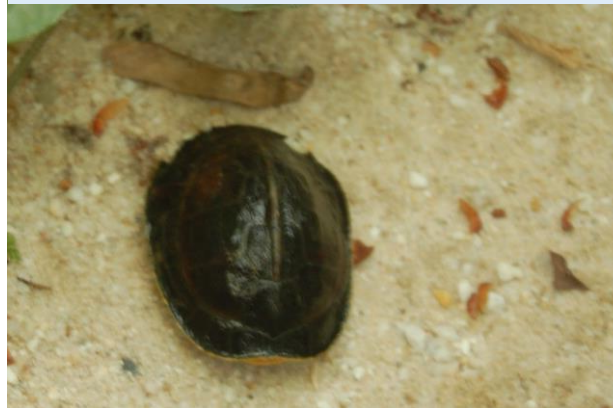
The 5 months old Malayan box turtle ( Cuora amboinensis ) has been looking after in an enclosure at Dau Tieng Station

In October and December, Dau Tieng Wildlife Conservation Station was delighted to welcome 2 Malayan box turtles ( Cuora amboinensis ) for a first generation, 6 Softshell turtles ( Amyda cartilaginea ) and 2 Psychedelic rock geckoes ( Cnemaspis psychedelica ). Especially, this is the first time that captive breeding of Softshell turtles has achieved success ( Amyda cartilaginea ) in this station. Indeed, the captive breeding program of several endangered species has been a main strategy of WAR for wildlife conservation.