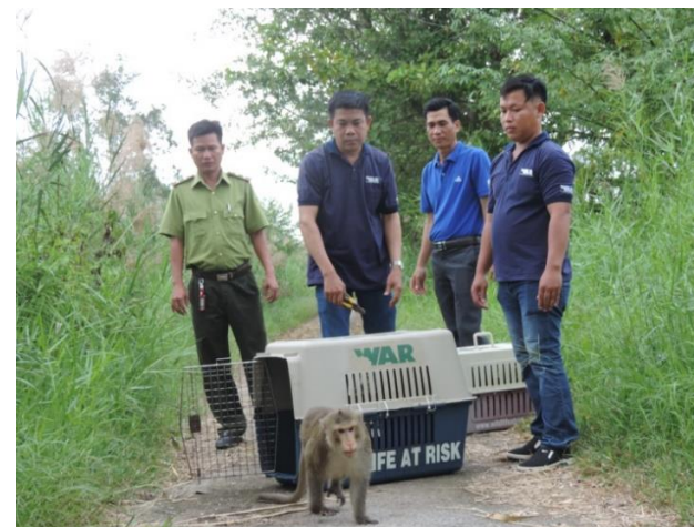
The Long tailed macaques returns home

On 14th November 2019 – 3 Long tailed macaques ( Macaca fascicularis ), 1 Bengal monitor ( Varanus nebulosus ) and 5 Malayan box turtle ( Cuora amboinensis ) with a total weight of 12.7 kg were successfully released to U Minh Thuong National Park, Kien Giang Province by Wildlife At Risk (WAR) in cooperation with Binh Duong Province Forest Protection Department and Forest Protection Department of Dau Tieng District.