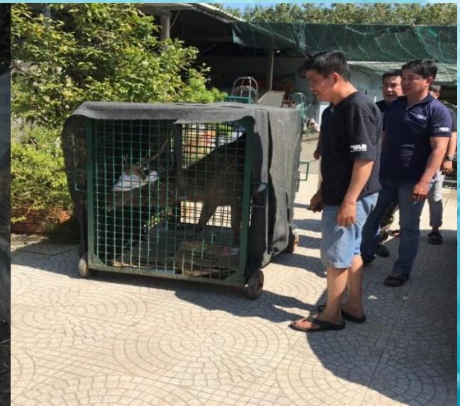
Photos of rescuing the Deer