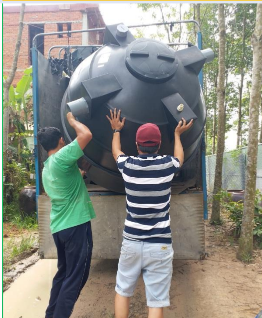
Photo 1: A Septic water tank of 2000 liters just arrived in the center.