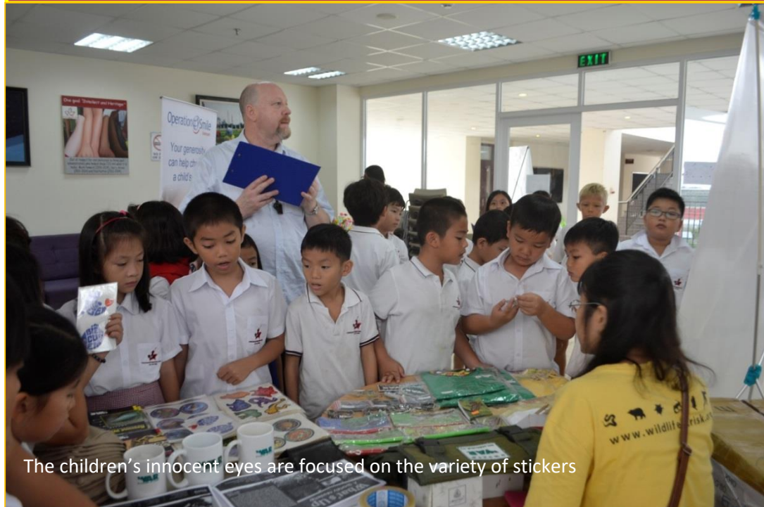
The children's innocent eyes are focused on the variety of stickers