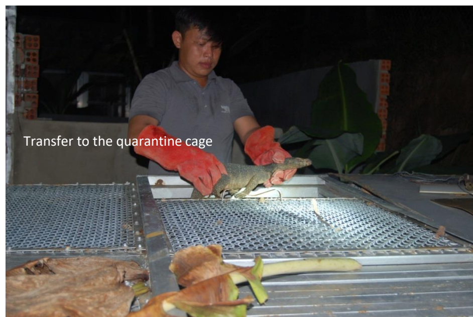
Transfer to the quarantine cage