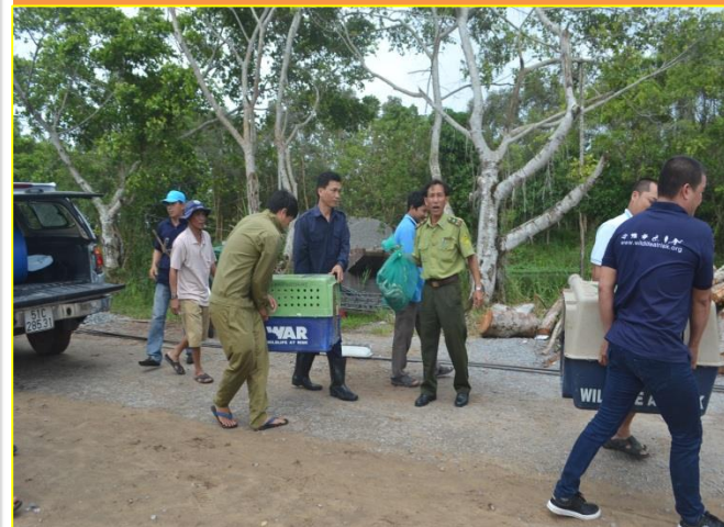
Photo 1: 35 Python molurus individuals arrive at U Minh Thuong National Park after the transport