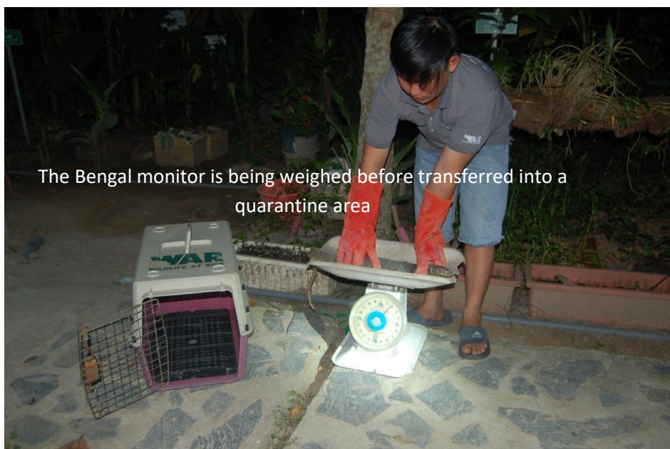
The Bengal monitor is being weighed before transferred into a quarantine area