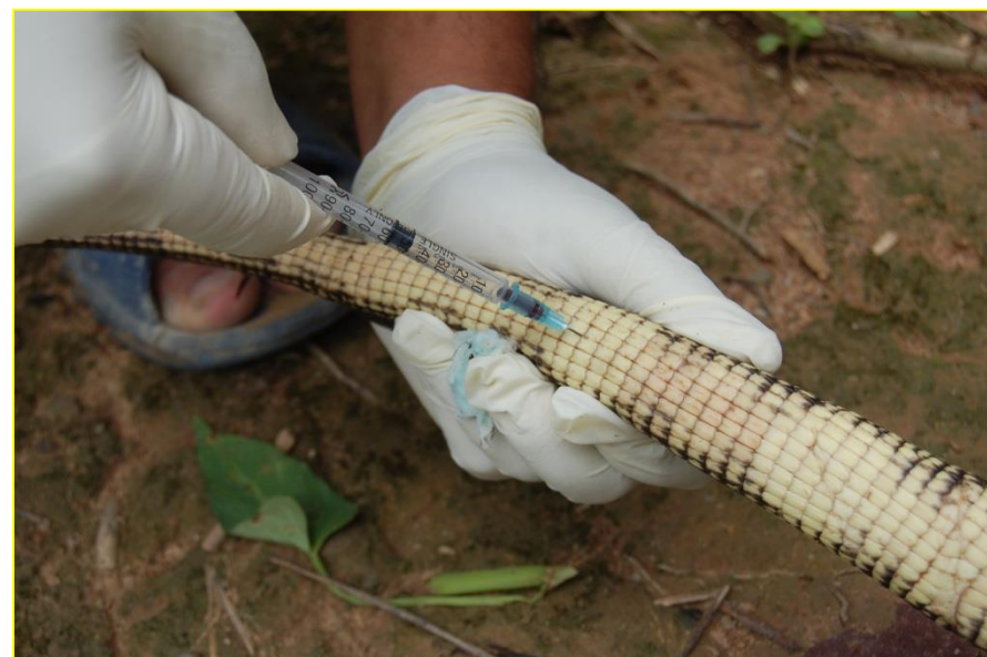
The veterinarian takes a blood sample from the water varan ( Varanus salvator ) to assess its DNA and to check on contagious diseases