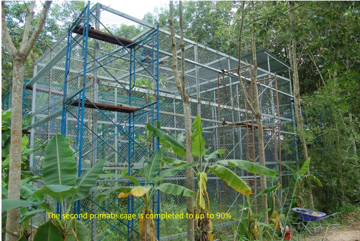
The second primate cage is completed to up to 90%