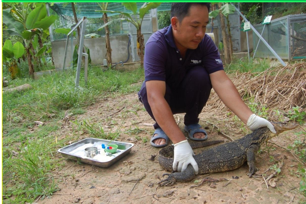
WARs veterinarian is performing a health check on a water varan ( Varanus salvator )