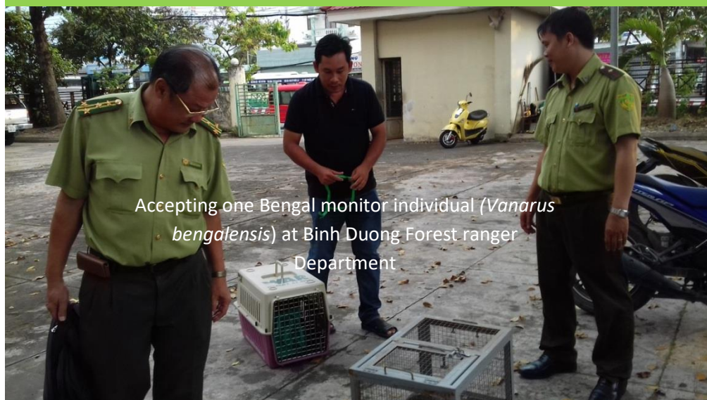
Accepting one Bengal monitor individual ( Varanus bengalensis ) at Binh Duong Forest ranger Department

On the 7 th September 2017, 1 Bengal monitor individual ( Varanus bengalensis ) weighing 0,8 kg was handed over to the Forest Ranger Department in Binh Duong province by a local. This is a positive sign of local communities' awareness on wildlife protection. With the active support of WARs staff, the Bengal monitor was safely transferred to a preservation center. Most likely, in the future our little friend will be able to return into wild nature.