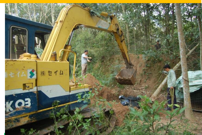
Photo 5: The tank was placed in the hole well balanced and with the appropriate measures.