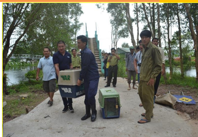
Photo 2: Staff of the National Park assist carrying them to the banks of a canal