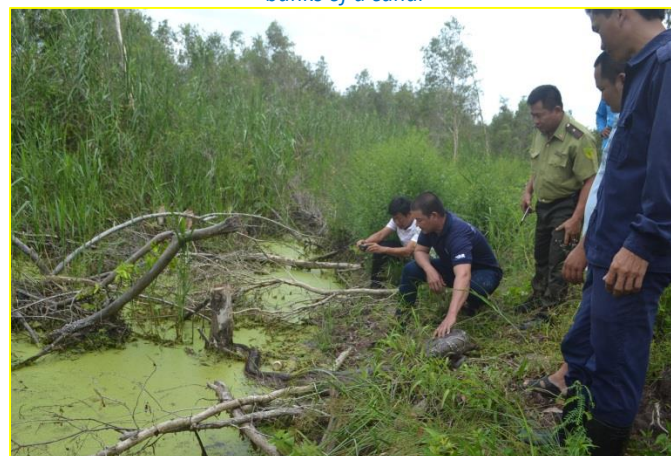
Photo 5: A big python slowly returns to its ideal living environment

1st August 2017 – In U Minh Thuong National Park – Kien Giang province, Wildlife At Risk (WAR) joined hands with the Forest Ranger Department of Binh Duong to successfully release 35 Black-tailed Python individuals ( Python molurus ), with a total mass of about 60 kg. All the individuals were warmly taken care of by WARs experienced staff and were treated before being released back into the forest. Most of these released animals were confiscated by forest rangers and the police in illegal wildlife trade. This is the third time WAR cooperated with Forest Ranger Department of Binh Duong province in rescuing and releasing illegally traded wild animals back into wild nature.