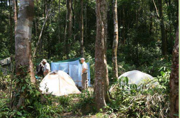
The survey camp site is deep in the forest and at about 1000m above sea level