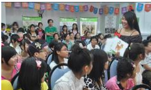
A nature game at the event (up) and university volunteer students of the project (down).

In this project, members of theme clubs and audience of Khan Quang Do magazine who are 12-15 years old, will experience and learn about wildlife rescue and nature protection through various creative and practical activities.