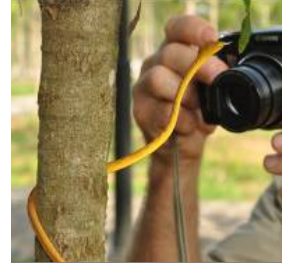
Survey in Vinh Cuu Nature Reserve

The specialists are working on the survey results to confirm the new species.