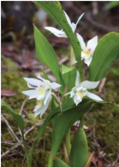
Coelogyne species, new wild orchid for Vietnam

This survey also revealed one new wild orchid species for Phu Quoc i.e. the Eria . WAR continues to conduct biodiversity surveys in Phu Quoc National Park in the period of 2010 to 2011.