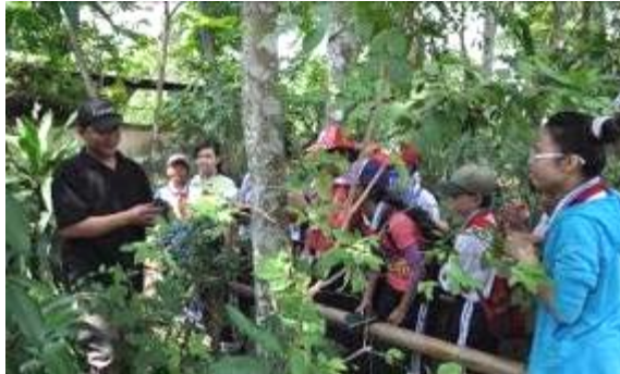
WAR staff introduces a rescue fresh water turtle

More than 30 students and teachers at Van Don Secondary School, Ho Chi Minh City visited Cu Chi WRS last May to learn about wildlife rescue and wildlife conservation. The students were excited to see the rescued animals, get to know about wildlife rescue, explore and learn about threats to wildlife and what they can do to help. In the afternoon, the students enjoyed wildlife games and signed a pledge canvas to commit on wildlife protection.