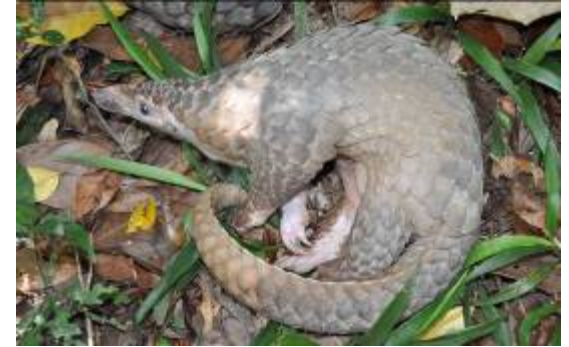
This Pangolin now enjoys her new free life at Lo Go Xa Mat forest, after staying at Cu Chi WRS for 3 months.

From Mar to June, more than 130 individuals of 22 endangered species have been released to the wild at Dong Voi Nature Reserve, Cat Tien, Lo Go Xa Mat, U Minh Ha and U Minh Thuong National Parks.