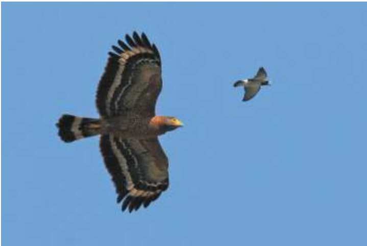
Adult in flight