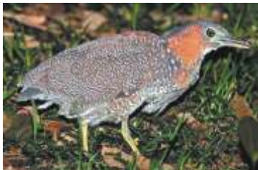
1st winter plumage

Description: Adult: Chestnut brown above with blackish vermiculations, black crown and long crest, blackish streaks on centre of throat and foreneck, dark-marked belly, short bill. Immature with white markings on crown and nape, upper and underparts heavily vermiculated whitish to buffish and greyish, whitish throat.