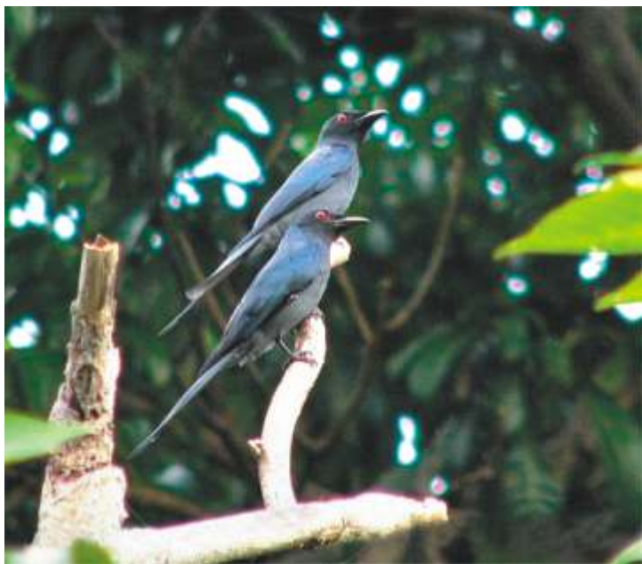
Adult mouhoti

Description: Adult mouhoti dark steely-grey with slightly bluish gloss, paler below, shallowish tail-fork. Reddish eyes. Adult leucogenis very pale and grey, black forehead, whitish lores, ear-coverts and vent.