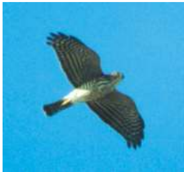
Juvenile female

- Female : Larger and browner than male, more obviously barred below, no breast-streaks and narrower tail-bands.