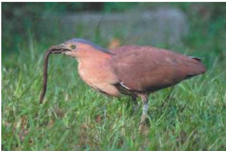
Adult male in breeding plumage