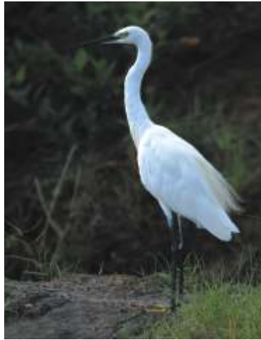
Adult non-breeding

Description: Adult non-breeding with all white plumage, mostly blackish bill, blackish legs, yellow feet. Adult breeding with long nape, back and breast plumes, reddish facial skin, blackish bill, black legs, yellowish to redder feet.