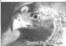
Crested Serpent Eagle