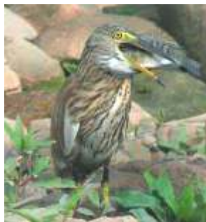
Non-breeding in winter