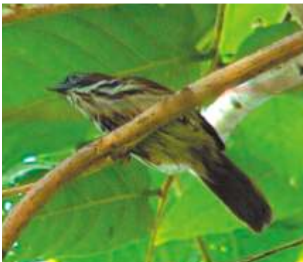
Adult from below

Description: Rufous crown, yellowish head-sides and underparts, yellow supercilium, narrow streaks on throat and belly.