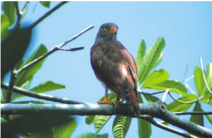
Adult from back