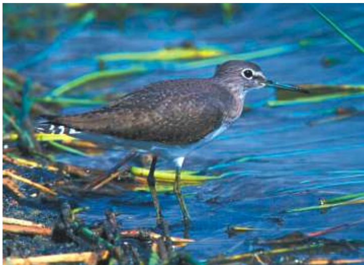
Adult non-breeding