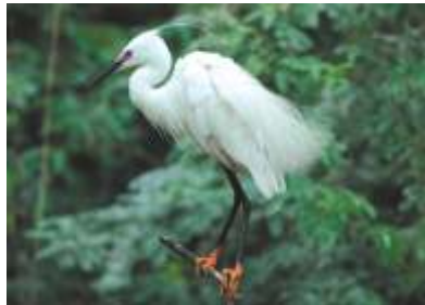
Adult breeding