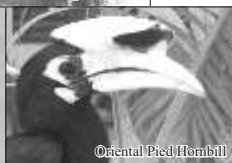
Oriental Pied Hornbill