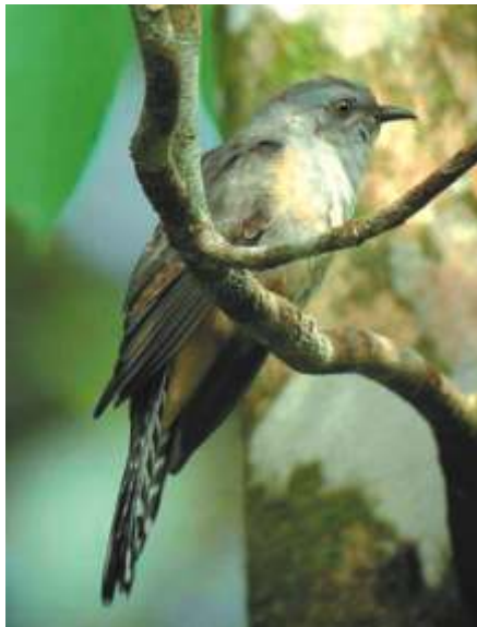
Sub-adult male