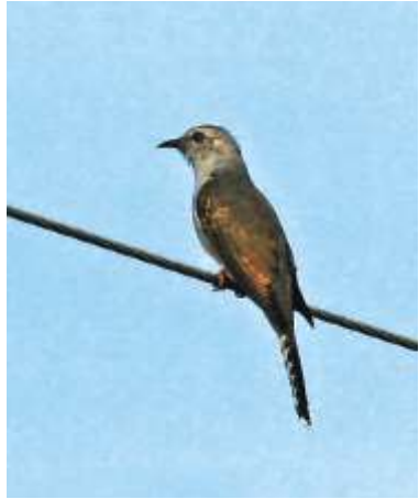
Immature male

Description: Relatively small, male with grey head, throat and upper breast, rufous belly and undertail-coverts. Female with rufous upperside with blackish barring, barred tail.