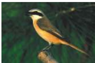
Male lucionensis with pale grey crown