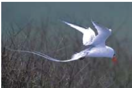
Adult from back

- Juvenile: Upperparts and wing-coverts densely barred blackish, small black spots on tail-tip, bill yellowish-cream with dark tip.