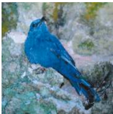
Male breeding pandoo