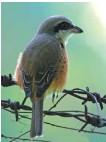
Male from back