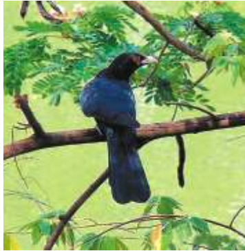
Male from back

- Female: with streak predominantly, spotted and barred white.