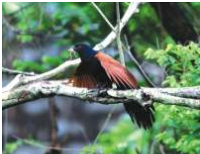
Adult with prey

Description: Relatively large, glossy purplish blue-black with uniform chestnut back and wings. Juvenile: back and wings duller with heavy blackish bars; rest of plumage blackish with small whitish streaks and flecks turning to buffer bars on lower body.