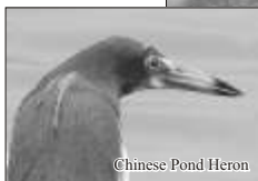
Chinese Pond Heron