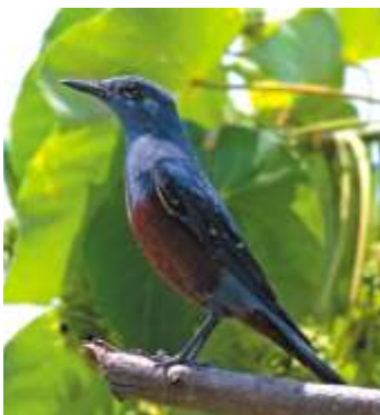
Male breeding philippensis