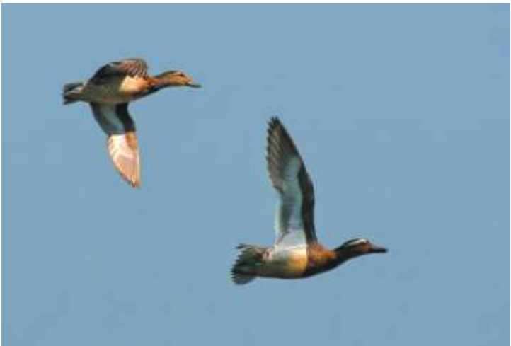
Male and female