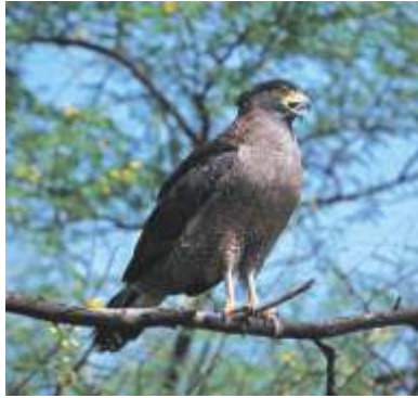
Adult from side

Mostly dark brownish with white-spotted plumage, black tail with broad white central band. Juvenile: Paler with head scaled black and whitish, tail whitish with three blackish bands.