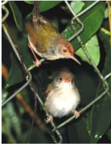
Male and female