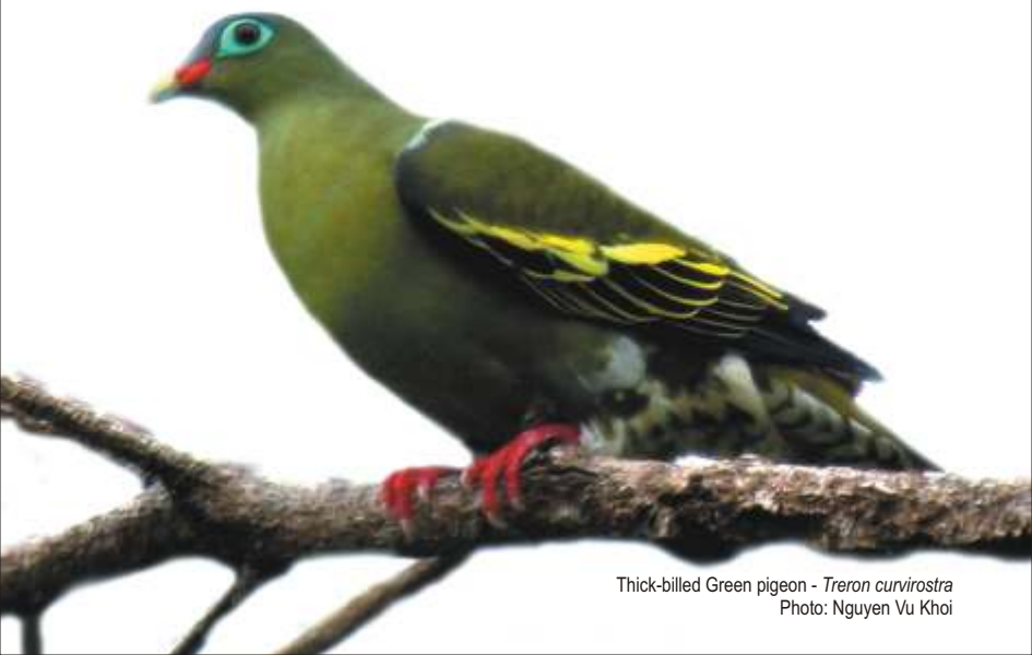
Thick-billed Green pigeon - Treron curvirostra