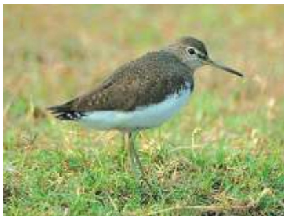
Adult non-breeding

Description: Adult non-breeding: Smallish and wader, blackish olive-brown above and on breast-sides with buff speckling, white jump, uppertail-coverts and underparts.