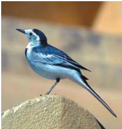
Male non-breeding leucopsis

- Male ocularis with black lower throat and breast.