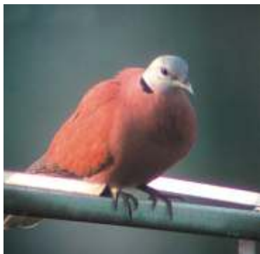
Adult male

Description: Relatively small, male with pale bluish-grey head, black hind neck-band, brownish vinous-red body and wing-coverts, grey rump and uppertail-coverts. Female with similar pattern to male but mostly brownish instead of reddish, less grey on head and uppertail-coverts.