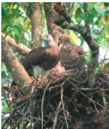
Adult and juvenile on nest