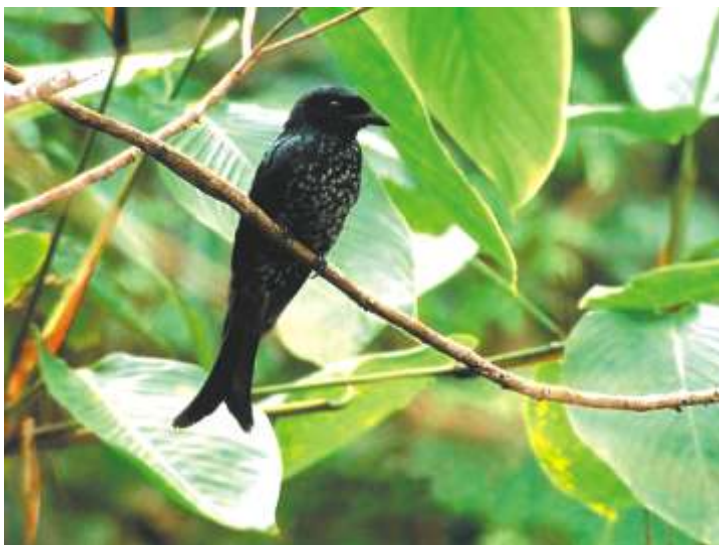
First winter

Description: Adult: Tail with shallower fork and more strongly up-curved outer feather tips than Black Drongo, bill much broader-based and longer. Plumage distinctly greenish-blue glossed. First winter with white spots on underparts.