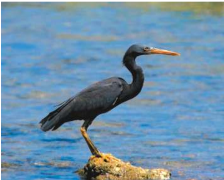
Adult dark morph non-breeding

Description: Adult dark morph non-breeding: Overall dark slaty-grey plumage.