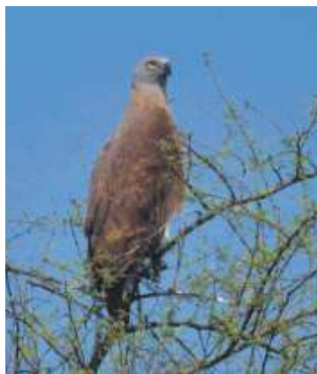
Adult from back