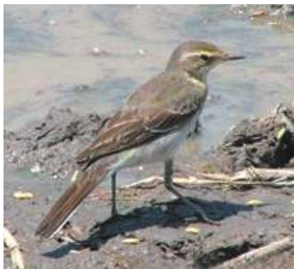
Immature female thunbergi