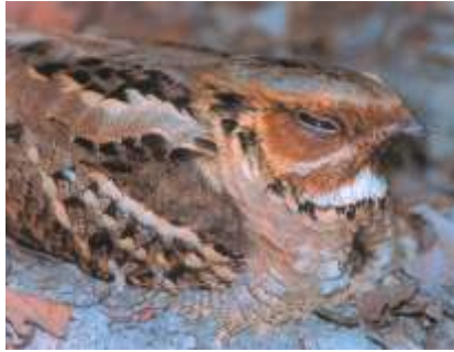
Male from front

Description: Fairly large, pale crown with dark centre, white lower throat, prominent row of black scapulars with broad whitish-buff fringes, large white patches on wings and tail.