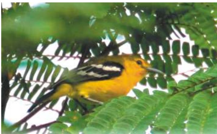
Male non-breeding