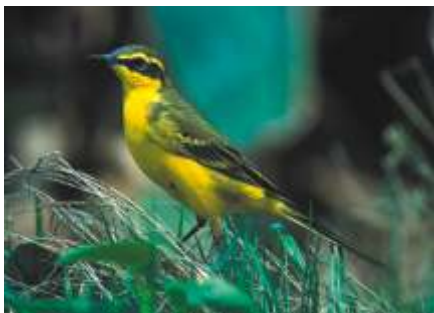
Adult male taivana