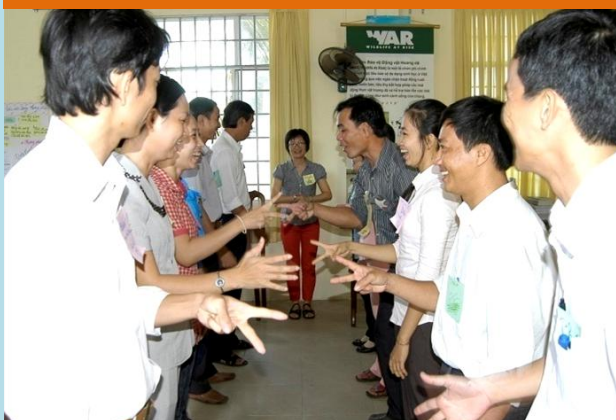
Teachers at the training course on operation of Blue Clubs

Last October, Six Blue Clubs named "My Sea" were set up in six secondary schools on Phu Quoc Island including Ham Ninh, Duong Dong 1, Bai Thom, Ganh Dau, An Thoi and Hon Thom. Each Club includes about 50 student members and is managed by two teachers who have been trained carefully on how to set up and operate a Blue Club. In this academic year, each Club meets at least once per month to learn about Dugong and endangered marine wildlife.