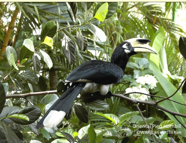
Oriental Pied Hornbill