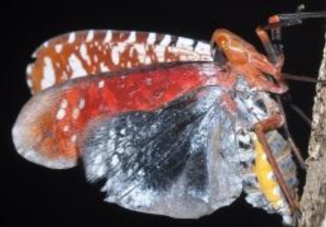
An insect recorded on Tho Chu Island.

All three surveys were conducted by WAR experts. Results of those surveys will be announced in the coming time.