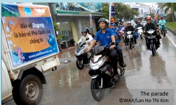
The parade

Phu Quoc, dated 26 September - A parade to raise awareness of Dugong and Endangered Marine Creatures was conducted at Duong Dong Town, Phu Quoc Island. Despite the weather, over 90 people took part and paraded in motorbikes through the main streets of the Town. Before the parade a meeting was organised at Duong Dong Culture House so that local leaders, local people, tourists and students were aware of the event and could participate in the parade. Approximately 400 people participated including leaders of local authorities on Phu Quoc Island, leaders and staff of Phu Quoc MPA, secondary school students, local people, tourists, and WAR staff and leaders.