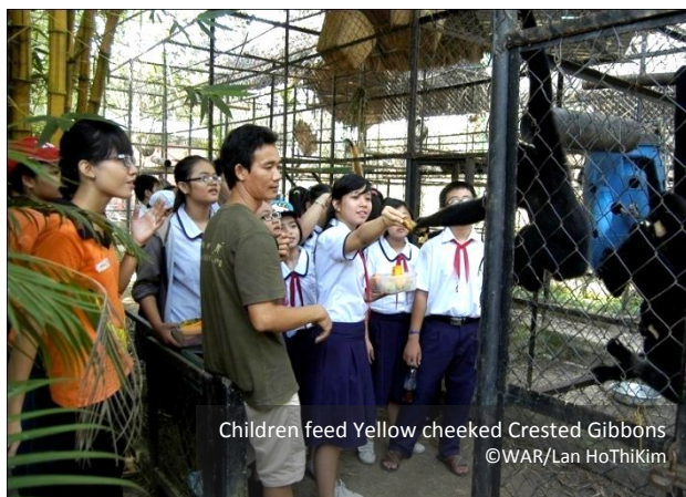
Children feed Yellow cheeked Crested Gibbons

Approximately 150 teachers and students from seven secondary schools of Tan Phu District visited Cu Chi WRS during the first semester. At Cu Chi WRS, the students learn, observe and interact with endangered wildlife. They were made aware of rescue activities and what they can do to help endangered wildlife. In the second semester of this academic year, more than 400 secondary school students and teachers will be visiting Cu Chi WRS.