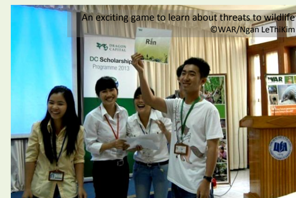
An exciting game to learn about threats to wildlife

After listening to a talk on the situation of Vietnam's wildlife, all students enthusiastically took part in some games and quizzes to further learn about Vietnam's endangered wildlife and its consumption. Students with correct answers or those who won a game received a WAR's T-shirt, cap, wristbands or set of ten wildlife postcards, or especially a ticket to join WAR's Summer Move programme next June. The students enjoyed the Ceremony and committed to take part in wildlife protection.