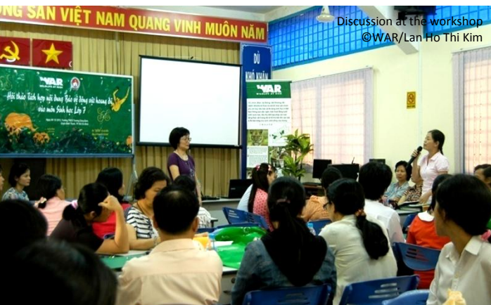
Discussion at the workshop

At the workshop, all teachers committed to integrate wildlife protection content into ten lessons of Biology Subject Grade 7. In this academic year, integration programmes will be applied to all secondary schools of Binh Thanh District and some secondary schools of Tan Phu and Binh Tan Districts.