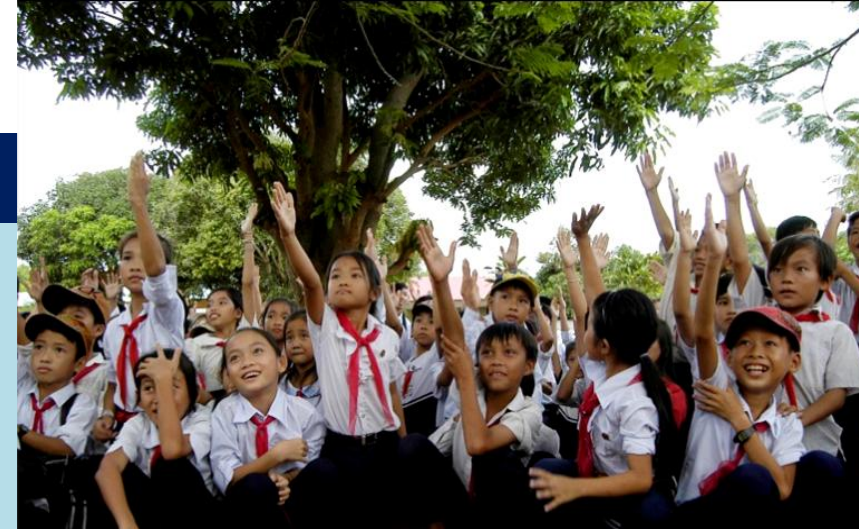
Students from Hon Thom Secondary School at the contest