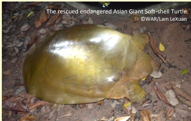
The rescued endangered Asian Giant Soft-shell Turtle

The Asian Giant Soft-shell Turtle is categorised as Endangered (EN) in the Vietnam Redbook. The species population is decreasing rapidly in the wild due to illegal hunting and trading for meat.