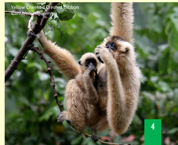
Yellow Cheeked Crested Gibbon