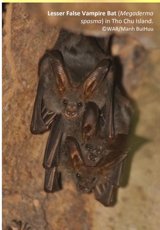
Lesser False Vampire Bat ( Megaderma spasma ) in Tho Chu Island.