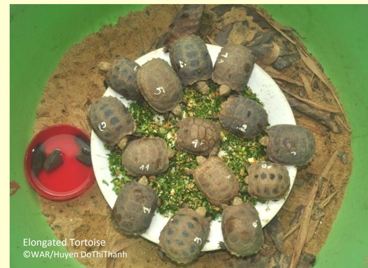
Elongated Tortoise