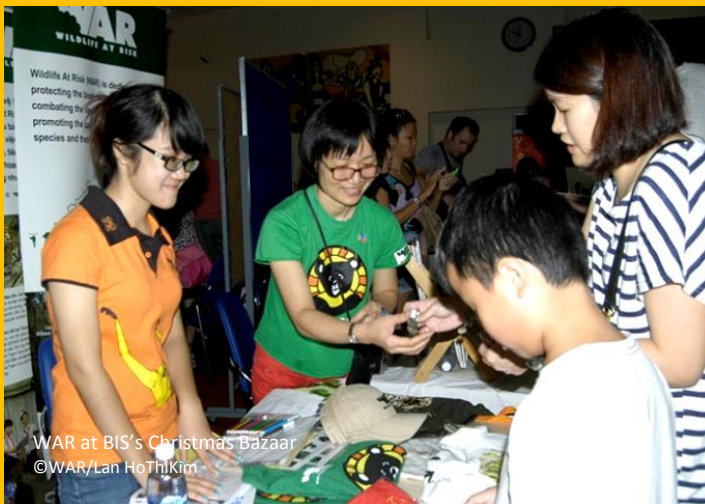
WAR at BIS's Christmas Bazaar

National and International media who cooperates closely with WAR over the past year to confront with illegal wildlife trade and help save Vietnam endangered wildlife.