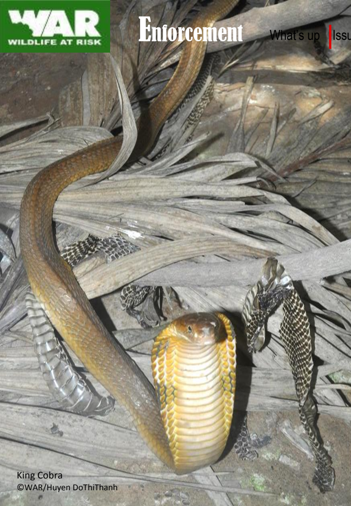
King Cobra