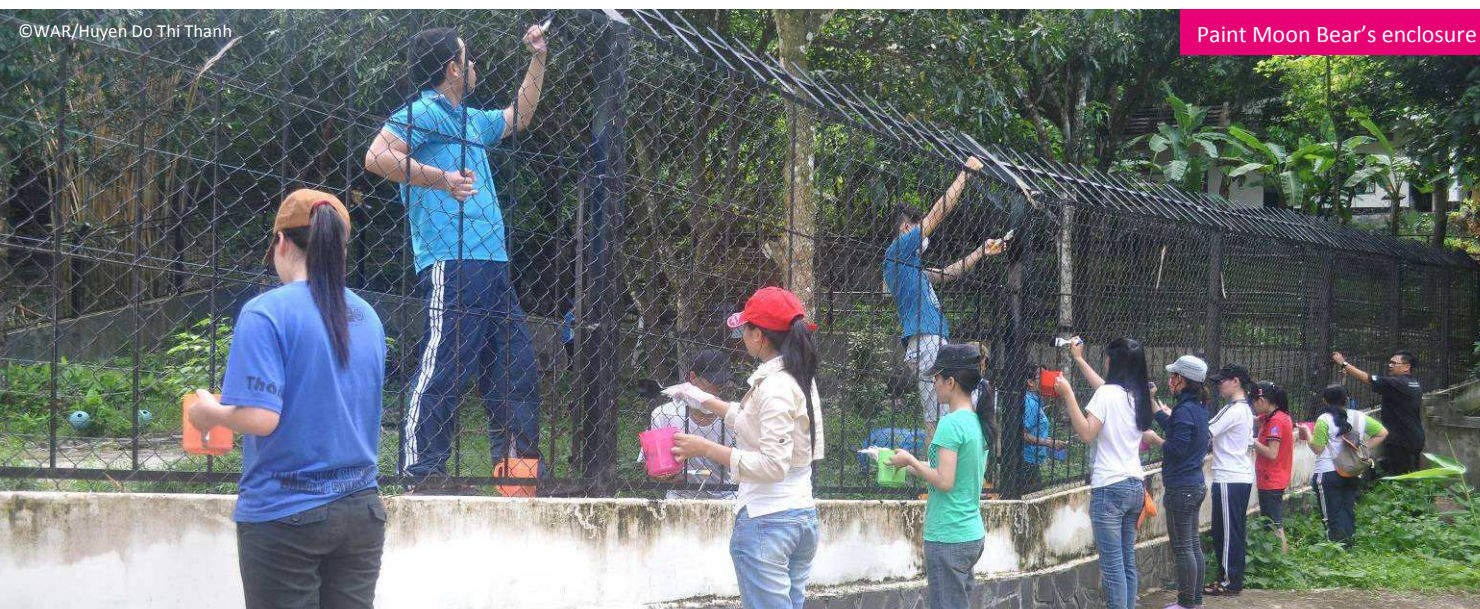
Paint Moon Bear's enclosure