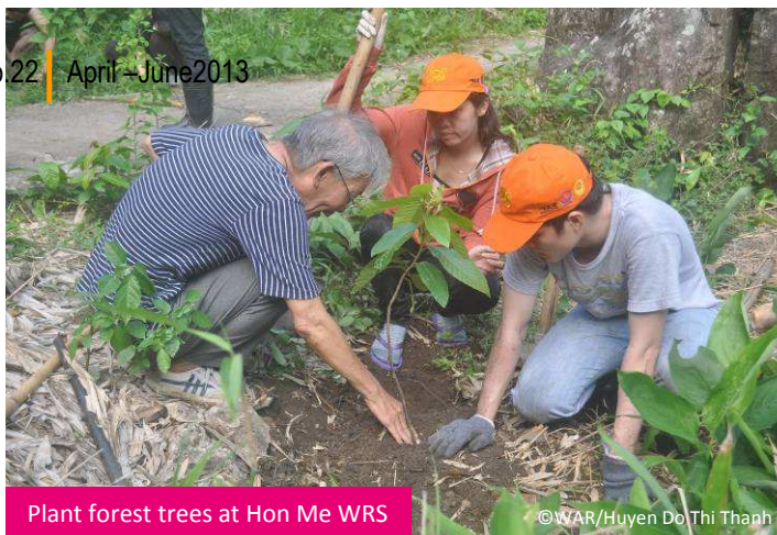
Plant forest trees at Hon Me WRS

The first "Summer Move" programme that lasted for five days and four nights was organised successfully at Hon Me WRS this late June. The students observed and learnt about endangered wildlife. They also helped prepare food and fed the wildlife, cleaned and painted wildlife's enclosures, grew some food plants for wildlife, and distributed wildlife protection leaflets to approximately 500 local households in Hon Dat District, Kien Giang Province.