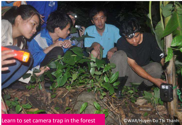
Learn to set camera trap in the forest