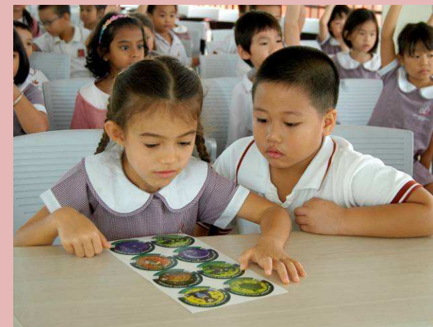
CIS students learning about WAR's wildlife conservation activities

International School South Saigon Pearl students organised a meaningful environmental week. The students learnt about wildlife and contributed cash to WAR's wildlife conservation activities. This great contribution is highly appreciated.