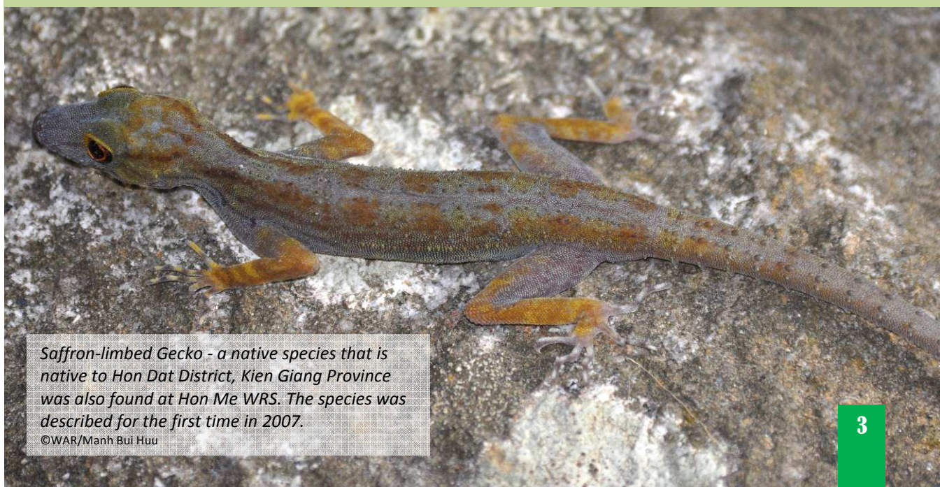
Saffron-limbed Gecko - a native species that is native to Hon Dat District, Kien Giang Province was also found at Hon Me WRS. The species was described for the first time in 2007.