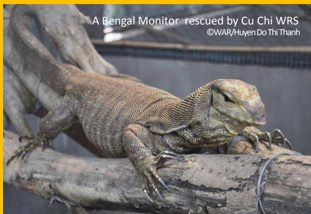
A Bengal Monitor rescued by Cu Chi WRS

Also in this quarter, 87 individuals of 12 species were released back to the wild including Yellow-cheeked Crested Gibbon, Pygmy Loris, Reticulated Python, Bengal Monitor, Barn Owl, Grant Asian Pond Turtle, Elongated Tortoise, Asian Palm Civet, Black-crowned Night Heron, Malayan Porcupine and Wild Boar.