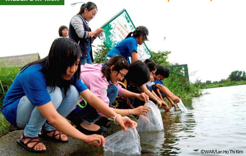
The native fishes were released by more than 20 university students from GFOC Club of Foreign Trade University and Society Group of Economic University, Ho Chi Minh City.