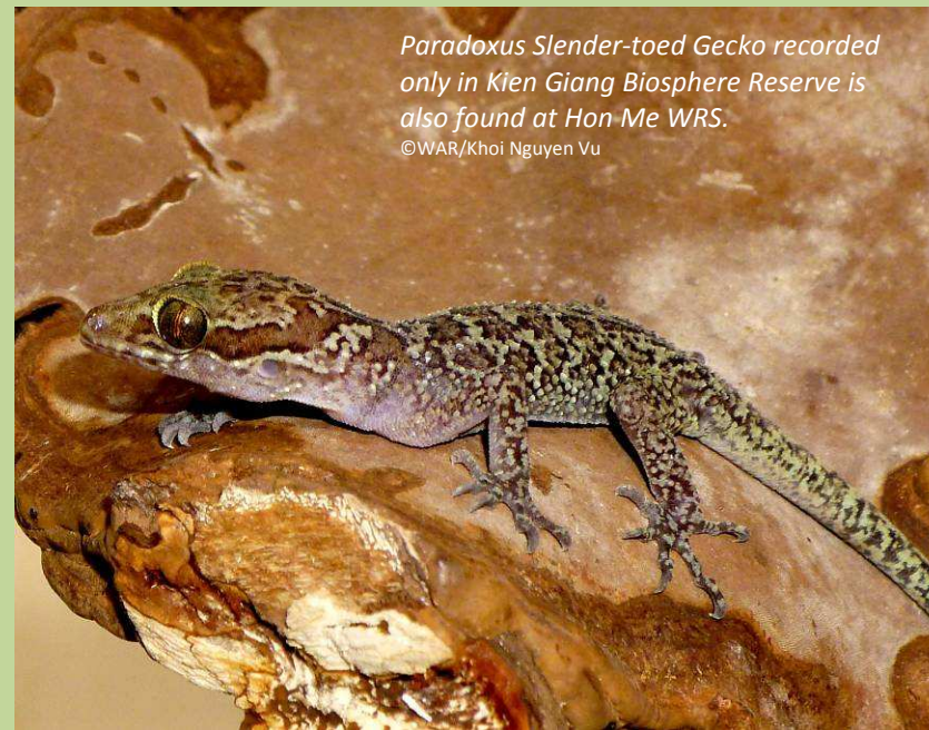
Paradoxus Slender-toed Gecko recorded only in Kien Giang Biosphere Reserve is also found at Hon-Me WRS.

Hon Me WRS has a total area of 3ha, which is much larger than Cu Chi WRS, and Cat Tien Bear and Wild Cat Rescue Station. The Station has dense vegetation and various wild species. Result of the survey is a strong base for WAR to implement conservation initiatives not only to rescued species but also species in the wild.