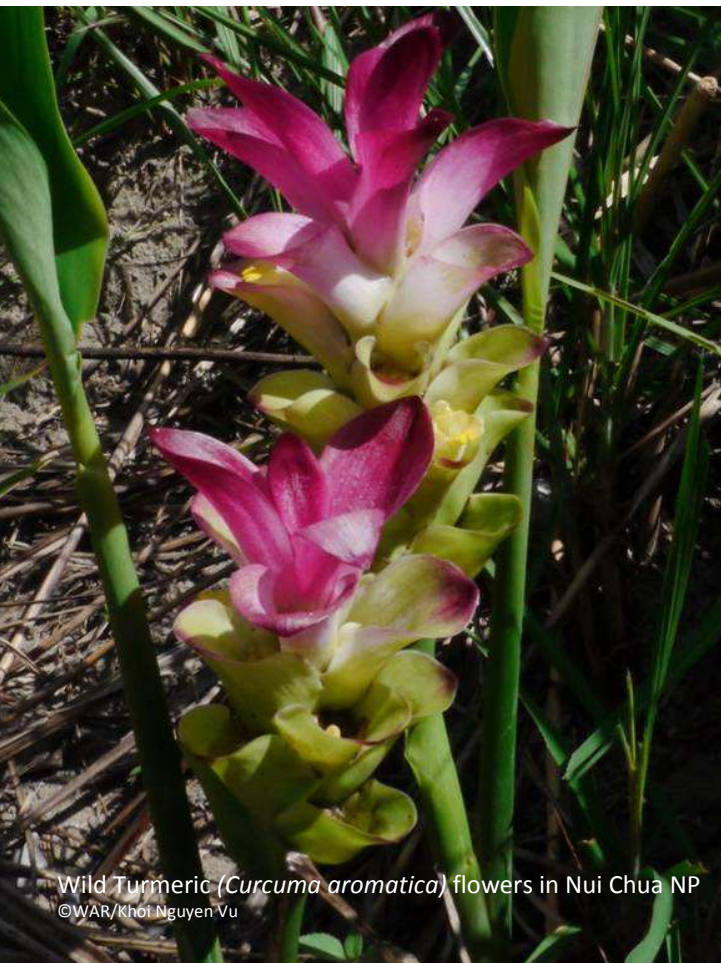
Wild Turmeric ( Curcuma aromatica ) flowers in Nui Chua NP

A biodiversity survey was conducted last May by national and international experts from WAR at Nui Chua National Park, Ninh Thuan Province. It takes the experts over six hours walking through semi-desert forest to tropical rain forest at 800m above sea level to reach the area where the survey was conducted. The survey recorded numerous endangered species with possible new species for Vietnam and the world. Further findings of this survey will be released soon.