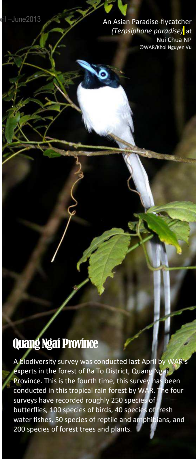
An Asian Paradise-flycatcher ( Terpsiphone paradise ) at Nui Chua NP